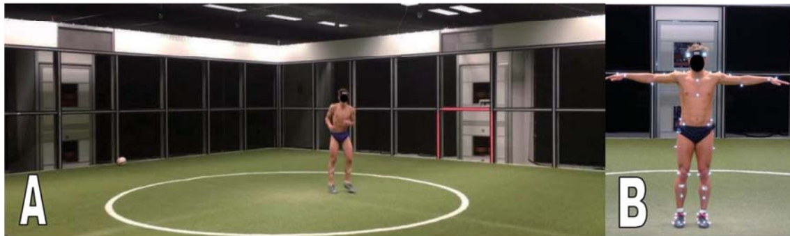
Figure 1: A - Inside of the Footbonaut™, B - Subject with attached Markerset

ing 20 to 30 passes per session. They received the ball from a dispenser right in front of them: The target, where the ball had to be passed, was always in the subjects' peripheral line of sight. Every ball was dispensed by the machine at 45 km/h at a vertical angle between 0 and 5 degrees and had to be received and passed as quickly as possible. Sixteen infrared cameras (MX-F40, Vicon, Oxford, UK) were used to collect kinematic data at 200 Hz. Sixty nine retro-reflective markers were attached to anatomical reference points on the subjects skin. Inverse dynamics and muscle force calculations were performed using AnyBody Modeling System (Version 6.0, AnyBody Technology, Aalborg, Denmark). A modified version of the Anatomical Landmark Scaled Model (Lund, Andersen, de Zee & Rasmussen, 2012) was used. Subsequently, data was processed using MATLAB R2015b (The MathWorks, Natick, Massachusetts). Muscle force data was used to calculate muscle stress based on the physiological cross-sectional area (PCSA) reported by Klein Horsman, Koopman, van der Helm, Prosé & Veeger (2007).