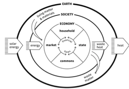
Figure 1: Kate Raworth's (2017) embedded economy model

All papers will address both dimensions of the symposium framework.