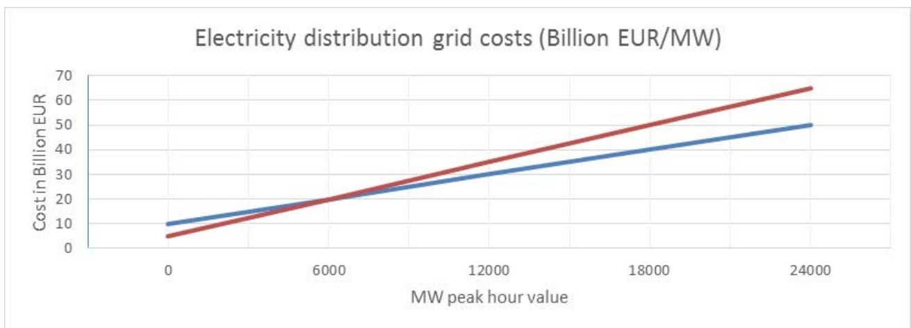
Fig. 1: Investment cost of electricity distribution grids as a function of the peak load in MW. The current grid in Denmark represent a peak load of 6,000 MW corresponding to an investment of 20 Billion EUR.

Here the above information has been put into cost-curves as shown in fig. 1. The curves assume a fixed cost of 5 and 10 Billion EUR respectively and relative costs so that the cost of the current distribution grid is 20 Billion EUR. The use of two curves illustrate the uncertainties related to these estimates.