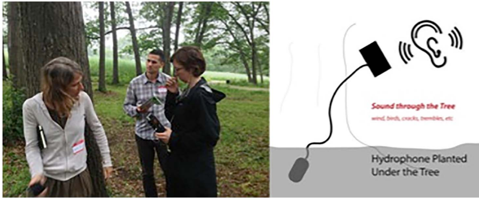
Fig. 2. Sketch for Bioprosthesis , a project for the sonification of trees. (2013, courtesy of http://stsdesignworkshop.tumblr.com/post/60137874191/bioprosthesis ).

museums, companies that want to offer cultural services to the market, academia, government bodies. These stakeholders are located within their own cultural, economic, socio-material contexts, where diverse and specific languages are in place and at work. While developing Curarium , metaLAB used arts- and design-based materials such as sketches, motion graphics videos, data visualizations and interactive prototypes to interact with these multiple stakeholders: these were all ways in which technological ideas and curatorial concepts behind Curarium were translated into visual, audio,