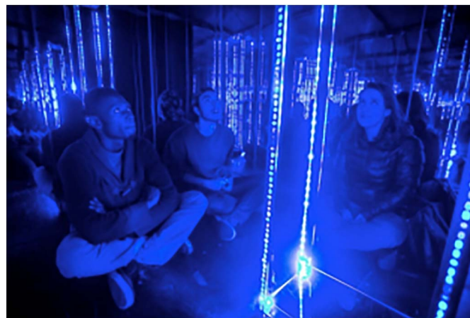
Fig. 3. A bit in the Abyss , by metaLAB. (2015).

The findings highlighted how metaLAB employs various art-based practices and design as a translational mechanism to connect and align various stakeholders in academic entrepreneurship. We will now use some categories of the Arts Value Matrix (Schiuma, 2011) to analyze how these translational mechanisms supported value creation. Examining metaLAB's projects shows that a common trait of the use of arts- and design-based initiatives is that they involve stakeholders first and foremost at a level that is entertaining, i.e. cognitively and emotionally engaging. Stakeholders taking parts in metaLAB's projects are