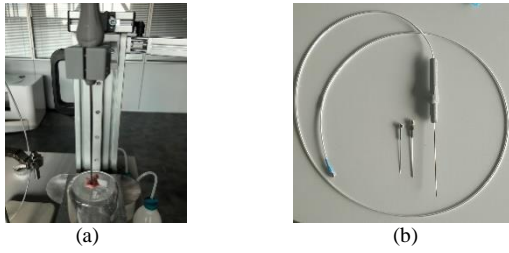
Fig. 1. Measurement set-up: (a) probe with the in vitro rat skin sample, and (b) three probes with 0.5mm, 0.9mm and 2.2mm diameters from left to right.