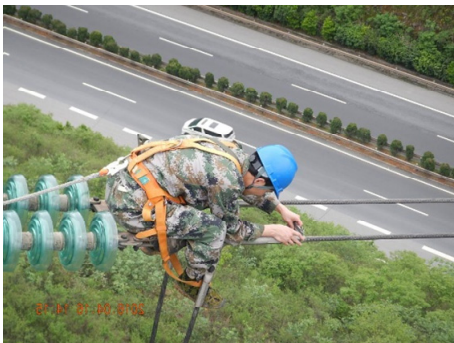
Fig. 6. Aluminum casing hydraulic crimping to margin detection