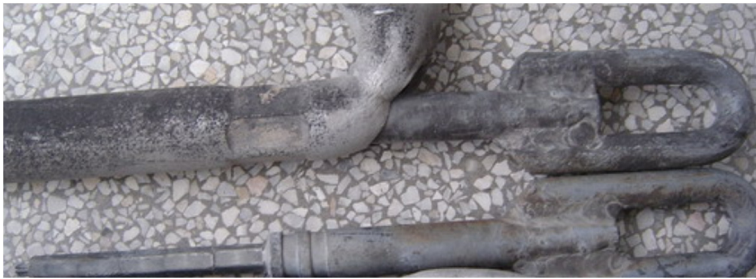
Fig. 5. Steel anchor comparison