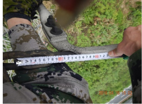
Fig. 4. Length measurement of steel anchor ring and crimp terminal