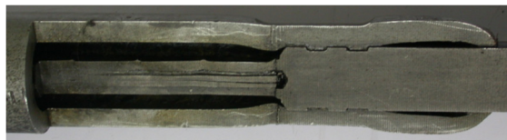
Fig. 2. Anatomy of the aluminum casing corresponding to the groove

In the ultrasonic testing, firstly, the ultrasonic thickness measuring device is calibrated, and one of the six crimping planes of the steel anchor aluminum sleeve is selected, and the paste coupling agent is evenly applied on the pressure bonding surface. On the basis of the above preparatory work, the probe of the ultrasonic thickness measuring device is lightly pressed on the center line of the crimping plane of the aluminum sleeve, and the thickness of the detecting crimping surface is slowly moved from the head to the tail along the longitudinal axis direction, and recording is performed. After replacing the other crimping surface of the clamp, measure the thickness of the crimped portion of the aluminum sleeve and record it in the same way. Finally, the thickness data is analyzed. If the thickness of the crimping surface is changed from 2 to 3 times greater than 1 mm in the longitudinal direction, it can be judged that the crimping position is accurate. The thickness of the two grooves is dissected as shown in Fig. 2. If the thickness in the longitudinal direction does not correspond to the change in the number of grooves, it can be judged that the crimping process is poor, and there is a crimping positioning defect. Ultrasonic field detection is shown in Fig. 3.