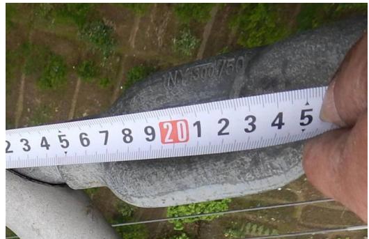
Fig. 7. Steel anchor steel number comparison