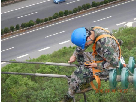
Fig. 3. Ultrasonic inspection of the thickness of the aluminum layer on the crimping surface

by the side of the wire and the side of the steel anchor ring. The two can be detected by using a vernier caliper to measure the margin, and then compared with the calculation formula of DL/T5285-2013. This method can judge the quality of crimping and the on-site inspection is shown in Fig. 6. In order to check whether the aluminum casing and the steel anchor have defects in “small generation” or “big generation”, the steel printing numbers on the two bodies can be compared. For example, if the steel stamp number matches the model of the wire in operation, it can be judged as no defect, otherwise the model error can be judged. Fig. 7 shows the steel anchor steel stamp.