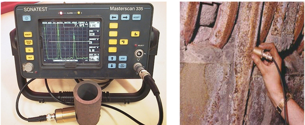
Fig. 1. EMAT transducer coupled with a popular standard UT instrument MS335 (left) and the manual EMAT thickness measurement performed on boiler tubes (right)

The experiments were done in laboratory using real tube samples obtained from power plants in Kazakhstan. These samples were exposed to real life conditions in boilers. The high temperatures, over 400-450 °C in the boiler causes the reaction between steel tube material and steam and flue gas producing hard, adhering scale with high contents of iron oxides. The scale is first produced on tube external surface, directly exposed to the flame, where temperatures are highest. For the purpose of obtaining magnetostrictive coupling between EMAT transducer and the tube it is not, however critical where the scale is located. Good indications were obtained with scale on either surface while testing from the outside. More important than location is the chemical composition of the scale, determining its magnetostrictive properties and its adherence to the parent metal. The scale thickness, even so emphasized in many previous publications was found not to be that important as authors were able to obtain good EMAT indications through scale ranging from less than few microns to 7 mm thick [7]. Figure 1 shows the EMAT transducer coupled with a standard off-shelf UT equipment and how the manual inspection is done on boiler tubes.