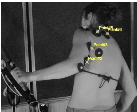
a) Experimental setup and markers placements over competitor's body

The measurement setup consisted of a control bar attached to the ceiling in order to retain the angle of deflection from the vertical line, observed while swimming. The load the loose ends of the flying lines imitated the thrust of the kite during swimming on the tack.