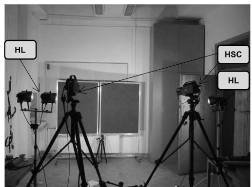
b) Vision-based measurements system: HSC – high speed cameras, HL – halogen lamps