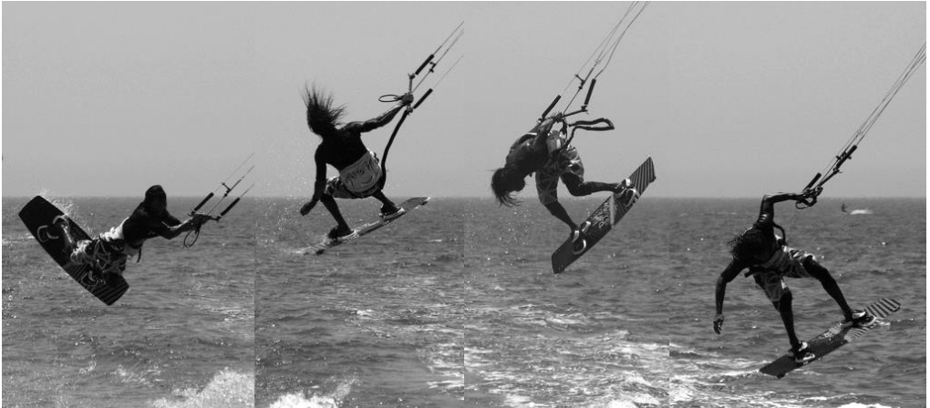
Fig. 1. Selected stages recorded during the performance of handlepass trick [4]

trajectory of selected points on the kitesurfer's body was conducted. These points were responsible the location of, respectively: 1 – elbow appendix, 2 – further attachment of arm triceps muscle, 3 – closer attachment the lateral head of triceps muscle, 4 – base of humerus, 5 – the place of the trapezius muscle fiber intermediates, 6 – trailers trapezius muscle for teenagers squamous spine. The aim of the study was to record the work of individual muscle structures during take-off and handlepass maneuver with handling the control bar by a kitesurfer and to assess their repeatability employing a vision system based on high-speed cameras.