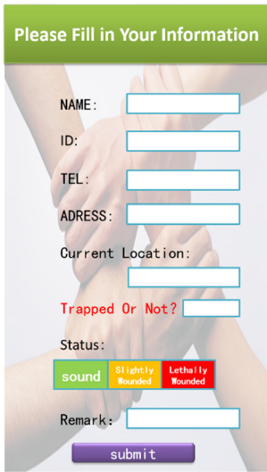
Fig. 2. The information inputting interface