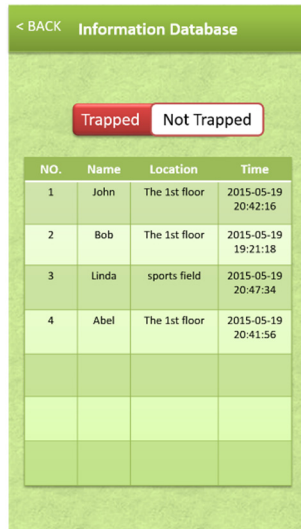
Fig. 3. The information inputting interface