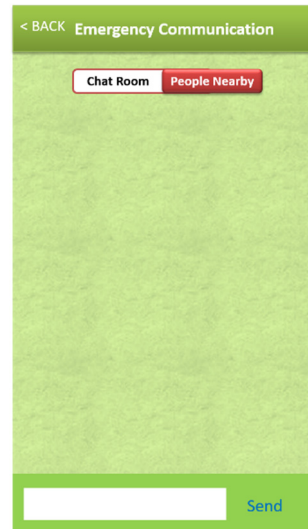
Fig. 4. The communication interface

After opening the software, the users should input their own personal information, and the interface is shown in the Fig. 2, which concludes such as whether you are trapped, the state of your health and your trapped address and so on. You are supposed to finish and submit them. At this time the personal information of the users are uploaded to the database of the “E-Explorer” that can sort you into the green regions, which means you are not trapped, or the red regions, which means you are trapped, according to what you have submitted. AS long as you click the consent that permit opening the blue tooth, although without any network, the “E-Explore” is in a position to search the counterpart nearby automatically and to connect with it after matching successfully. Their connections will contribute to the information sharing between two databases, indicating that you can acquire the personal information of your partner and transmit the text message freely. Besides, when two users can’t connect with each other when the distance is too long, if there is one user who have opened his “E-Explorer” between them, which can be seen as a node to connect them, they could also realize mutual connections and information transmission. If the distribution of users in the region is extremely dense, any pairwise users within the scope of a temporary distance can achieve communication. That is to say the “E-Explorer” constructs a temporary communication network system in the earthquake region.