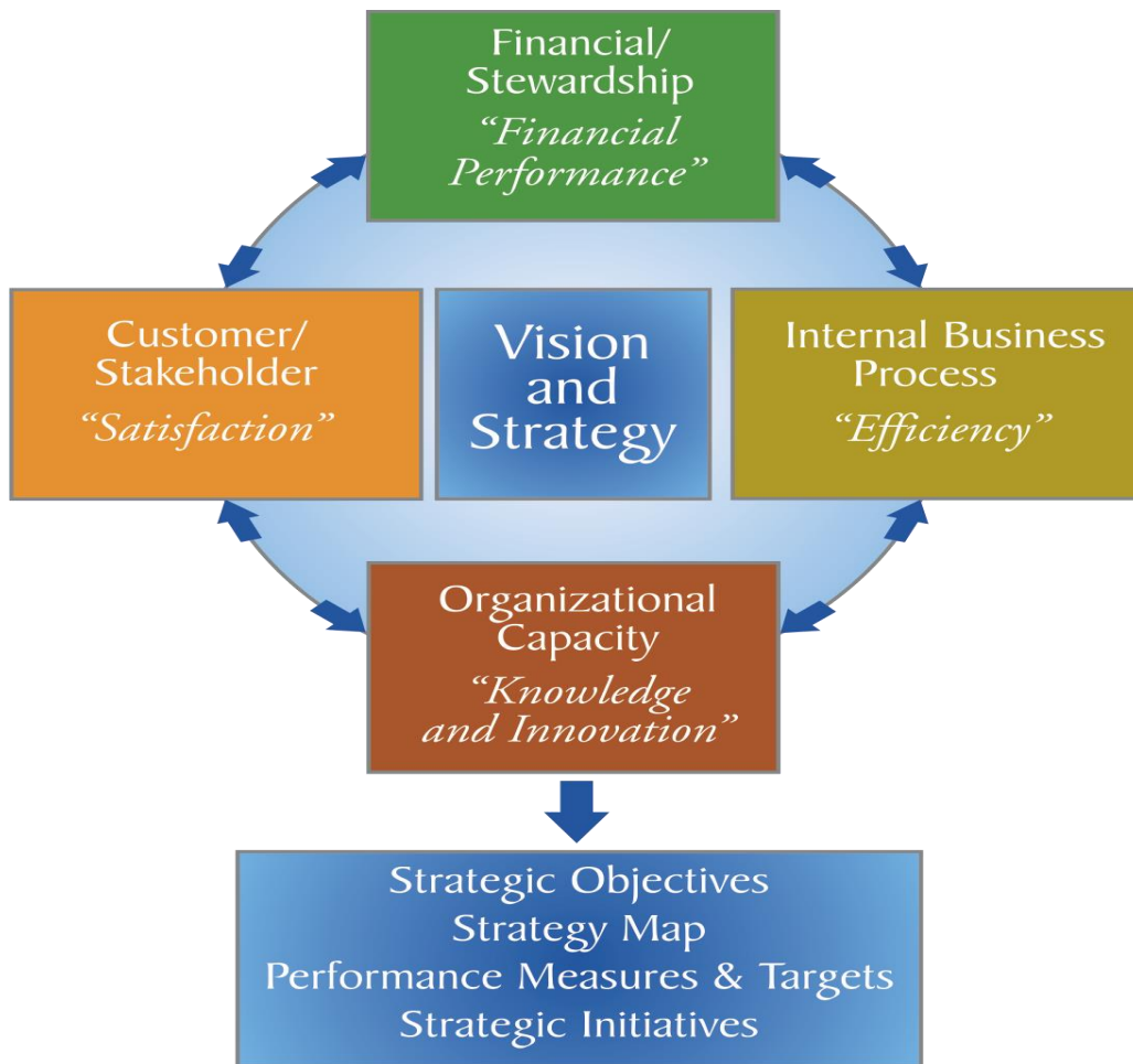
Figure 1: Balance Score Card