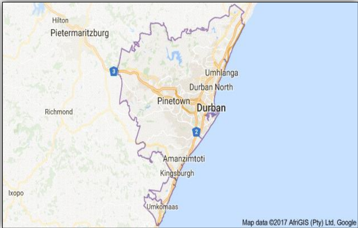
Figure 3: Map of eThekweni Municipality