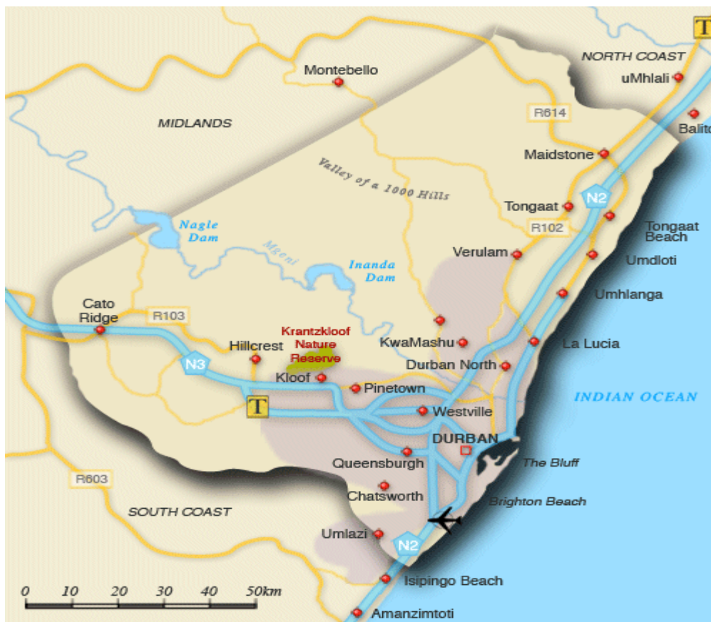
Figure 3.1 Map of City of Durban, Kwa-Zulu Natal