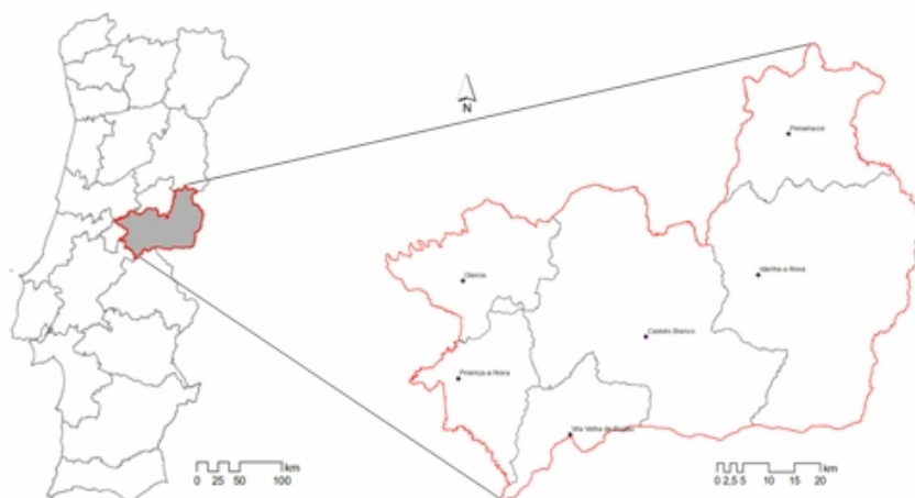
Figure 1. Study area location

The Beira Baixa region is an administrative division in eastern Portugal and integrates the Beira Interior Region. The region covers an area of 4,614.6 km 2 and has a population of 84,046 inhabitants. The area includes four municipalities: Idanha-a-Nova, Penamacor, Vila Velha de Ródão and Castelo Branco. This territory is mainly occupied by forest and agroforestry uses (60.8 %) and agriculture (36.2 %).