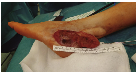
Fig. 2. Calcaneal defect after extensive debridement – approximately 4.5 cm of bone gap.

ware removal, but the infection recurred every time (osteomyelitis was documented in bone samples). On physical examination, the patient had a small soft tissue deficiency (3 × 3 cm) in the lateral border of the foot and a sinus tract. The MRI confirmed calcaneal osteomyelitis (Fig. 1a). The patient was then submitted to extensive debridement of necrotic bone and the area was covered with a neurocutaneous reverse flow sural flap. Even though the flap was totally viable and healed well, the sinus drainage recurred a few weeks afterward (Fig. 1b).