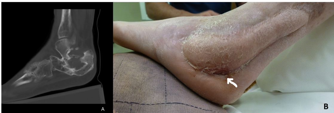
Fig. 1. A – Calcaneal osteomyelitis in MRI. B – Pre-operative photograph with sinus tract (arrow).