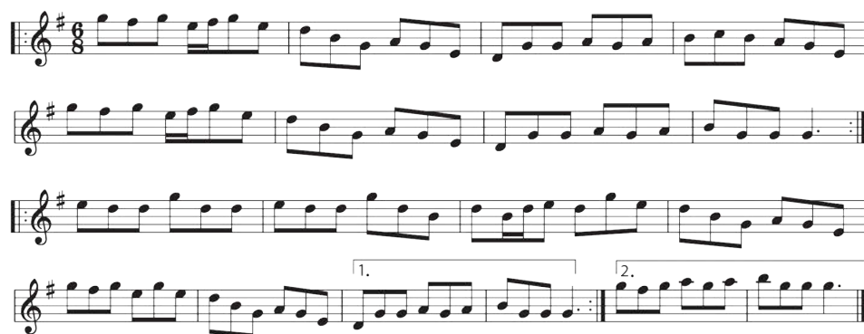
Figure 5 'The Fire on the Mountain'