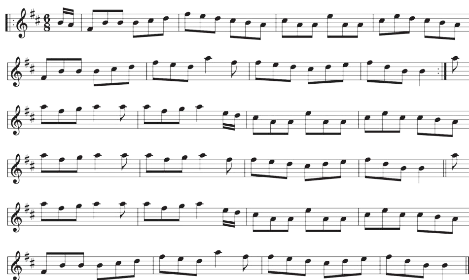
Figure 6 'The Mug of Brown Ale'