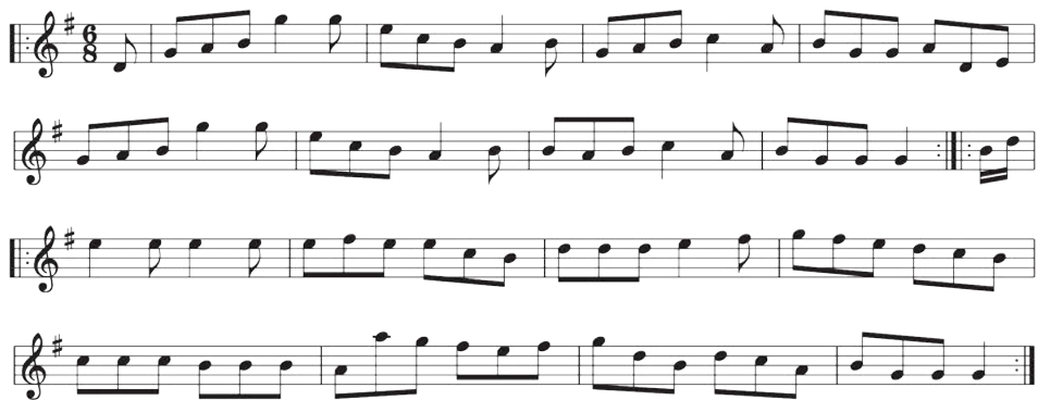
Figure 4 'Rakes of Dromina'