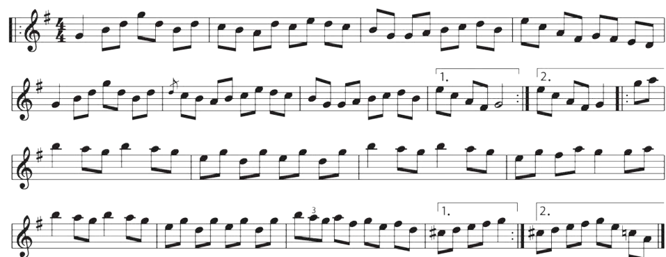
Figure 8 'Coming through the Field'

The manuscript contains a selection of tunes and settings which have now vanished from the popular repertory, both locally and nationally, and represents that of a traditional musician in the Churchtown area of North Cork during the late nineteenth and early twentieth centuries. The vast majority of the tunes, and indeed many of the tune-types, which the manuscript contains, are no longer found in the aural repertory of the area. The manuscript therefore provides a snapshot of the music of a small rural community at a particular point in time. The tunes and tune-types are similar to those used contemporaneously in other areas of the country, although it is likely that many of the settings were unique to the area. The mixture of Irish and non-Irish material is not unusual for the era; the influence of the travelling companies, and the military band in Buttevant, may also have been