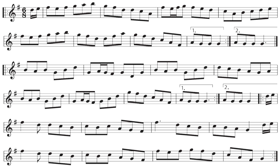
Figure 3 'Walls of Lis Carroll'