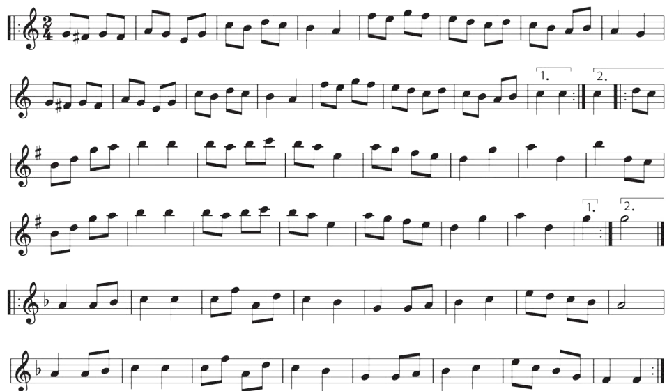
Figure 7 'The Prince Imperial Galop'