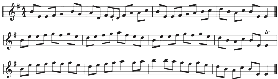
Figure 10 'The Kerry Star'