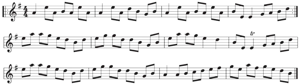
Figure 9 'The Blue Bells of Scotland'