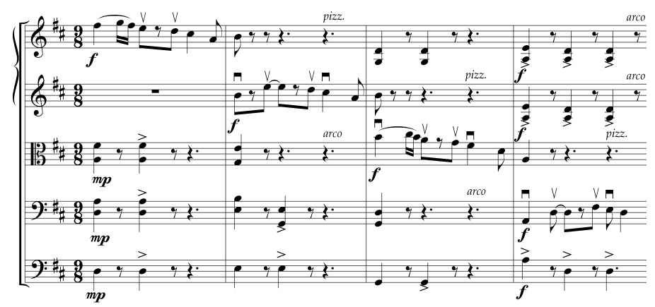
Figure 1 'Sally on the Hilltop', demonstrating melody distribution<sup>10</sup>

to giving the melody to each part in turn while keeping the folk/fiddle style. In this way I have been able to make all the parts for the various instruments interesting and fun to play. In a student orchestra it is difficult to inspire members of the orchestra to play musically and their best when their parts are dull and repetitive. Many students, stuck with playing a 'third violin' part, which is also the viola part in elementary orchestras, not only find their parts to be monotonous, but also see it as unimportant to the effect of the piece as a whole. Rather than inspiring them to play well, they are indifferent or uncaring. When students have melodic material, interesting counterpoint and innovative accompaniment figures, they are much more likely to enjoy playing and practising their parts.