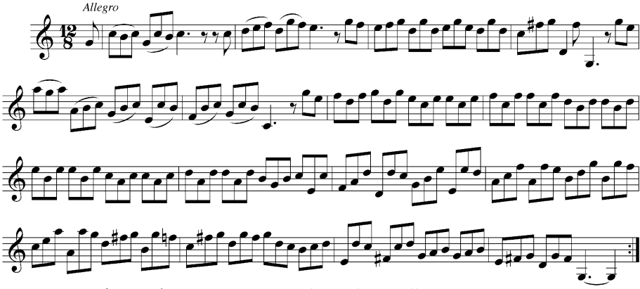
Figure 3b Baroque giga, Archangelo Corelli (1653–1713) Giga , Sonata Opus 5, no. 3, v, bars 1–16<sup>14</sup>

Figures 3a and 3b demonstrate how the baroque Giga developed from the folk dance form. Both are in compound time, although Corelli's Giga is in 12/8 rather than 6/8. In the fiddle jig, the A section is a typical eight measure phrase, followed by an