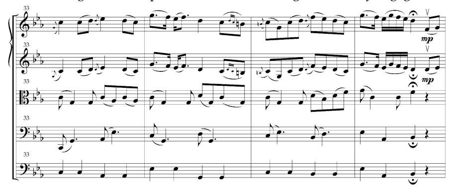
Figure 2 'Roslin Castle', demonstrating counterpoint and accompaniment.<sup>11</sup>

This is an example of how the melody passes through the orchestra. The first measure of the melody is in the first violins. The second measure of the tune is in the second violins. The third measure is in the viola part, and the fourth measure is given to the cello section. This encourages all parts to listen to each other. In this way they become more aware of the other parts of the orchestra and what they are playing. The accompaniment of the tune in this particular example simulates a piano or guitar, but is still interesting, which keeps the musicians thinking and actively engaged.