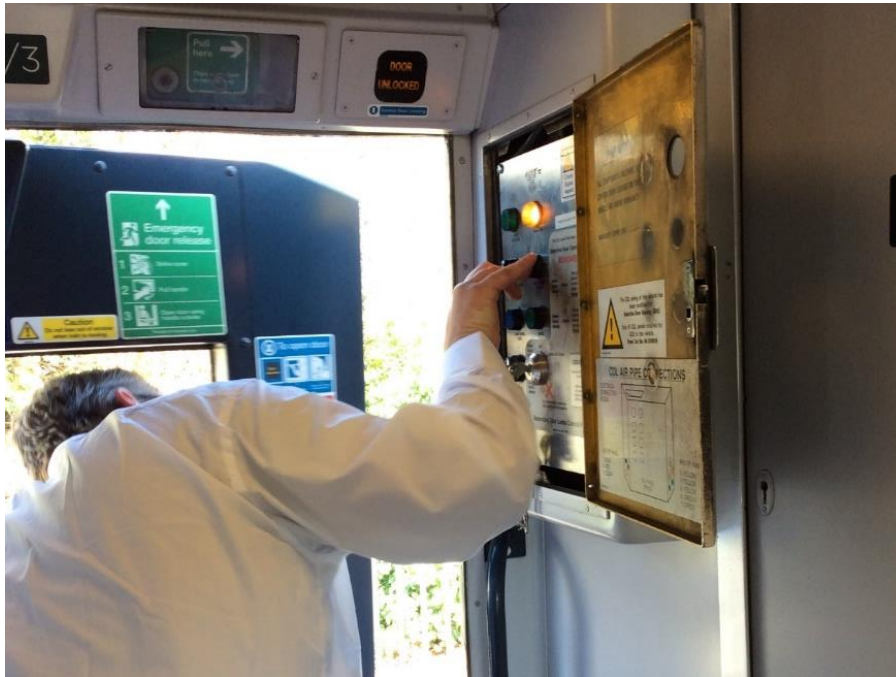
Figure 7 – TM signalling to the driver and opening the door

On the approach to each calling station, the TM has to perform the door procedure (Figure 7) consisting of approximately 20 steps, including announcement, communication with the train conductor via the control panel buzzers, unlocking doors, walking down the platform and doing specific hand gestures and whistle signals. This process is even more complicated at stations with short platforms or without platform staff. It can be stressful given its complexity and coupled with the fact that passengers' behaviour can cause delays and raise safety alerts. In addition, the procedure was performed up to 16 times on a single journey [TM10] and varied with train characteristics.