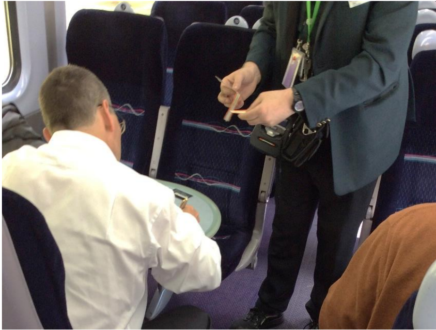
Figure 5 – Passenger signing the sale counterpart

TMs also sell tickets and can earn 5% of their monthly sales, after a £1000 threshold. Some reported gains of £400 on top of their salaries. The possibility of monetary gains makes the process of selling tickets usually positive. However, sometimes it is a time-consuming procedure given that the current machines are not contactless, and that chip and pin devices are sometimes out of order, requiring the swipe and sign method (Figure 5). “We’re not even online. We ask them to sign, and check the signature on the back of the card. Now there are just touching cards, contactless, but here we still use to sign. They need to keep up with technology” [CH6].