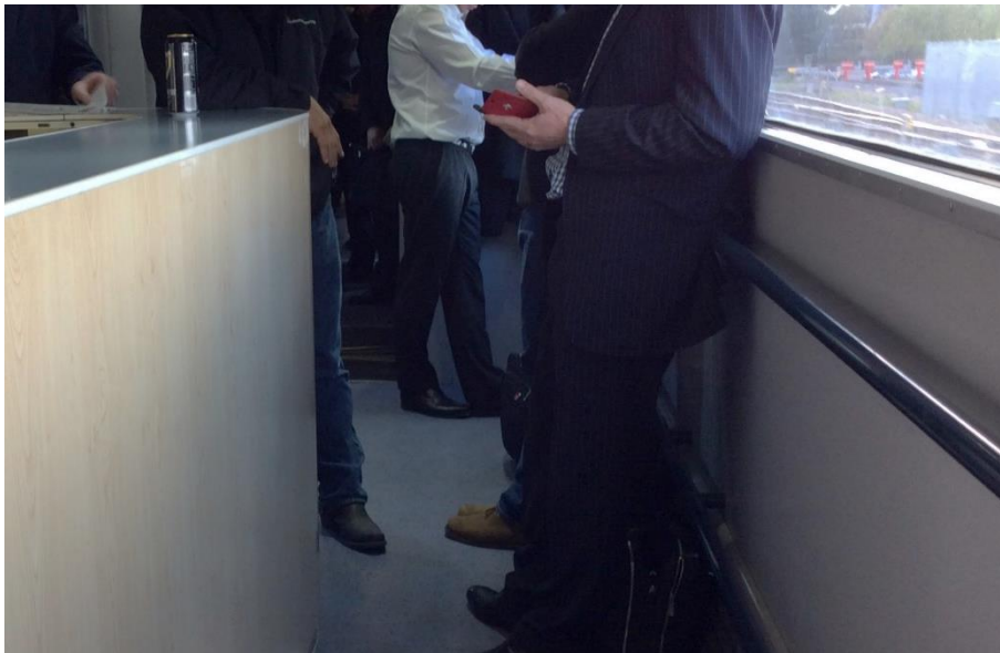
Figure 4 – Crowded service preventing the TM from going through the coaches beyond the buffet car

Checking tickets can sometimes be a negative experience, which TMs would rather not do. The time of the day can affect the dedication to revenue protection, and often they are strategic in order to minimise effort. TM22 described that “in the evening it’s harder to validate tickets, passengers are tired and trains are busier” . In some routes, there are specific stops notorious for fare evaders. Dealing with someone who refuses to pay can be a challenging situation, as TM3 exemplifies: “I don’t want to get slapped, and I don’t want to delay the train. So my hands are tied” . In some occasions, TMs cannot check tickets, such as when the service is crowded with passengers obstructing corridors (Figure 4).