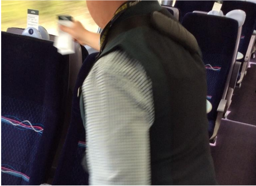
Figure 6 – TM removing unused reservations en route

Often passengers do not show up on the reserved service or decide to sit elsewhere. Sometimes crew remove unused reservations if they see that they are for stations they have already been to (Figure 6). Very rarely crew have to manage disputes over seats , checking passengers' tickets and asking them to give the seat back to whom it belongs. However, in busy services, during a disruption or if the reservations are not in place, it can be stressful for crew. TM1 exemplified: "I had a busy train where passengers had been arguing with each other because they've booked a seat and the reservation labels had not been put up... you have to cancel reservations, and that just caused the worst train nightmare" . TM3 reinforced the need for a system to be in good working order: "The reservation system is rendered pointless when it doesn't work... So when it works it is good, when it doesn't it makes things twice as bad as no system at all" .