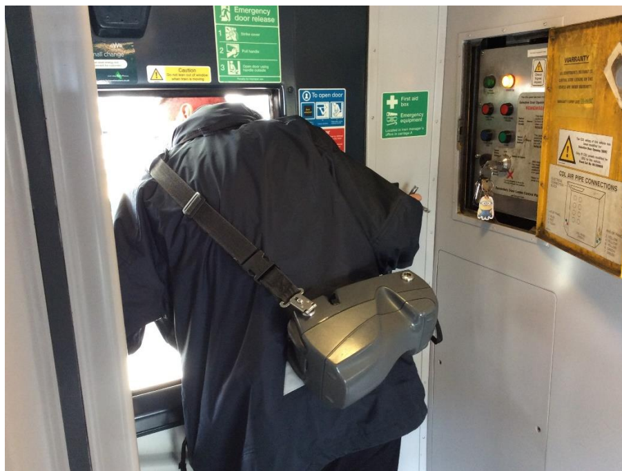
Figure 2 - Train manager checking the platform during departure, on an HST class 43

By the time of departure, the TM is on board the train by the door, checking for last minute passengers intending to catch that train, and ready to dispatch the train (Figure 2). This can be a very stressful situation especially in busy stations and at rush hour, with passengers running down the