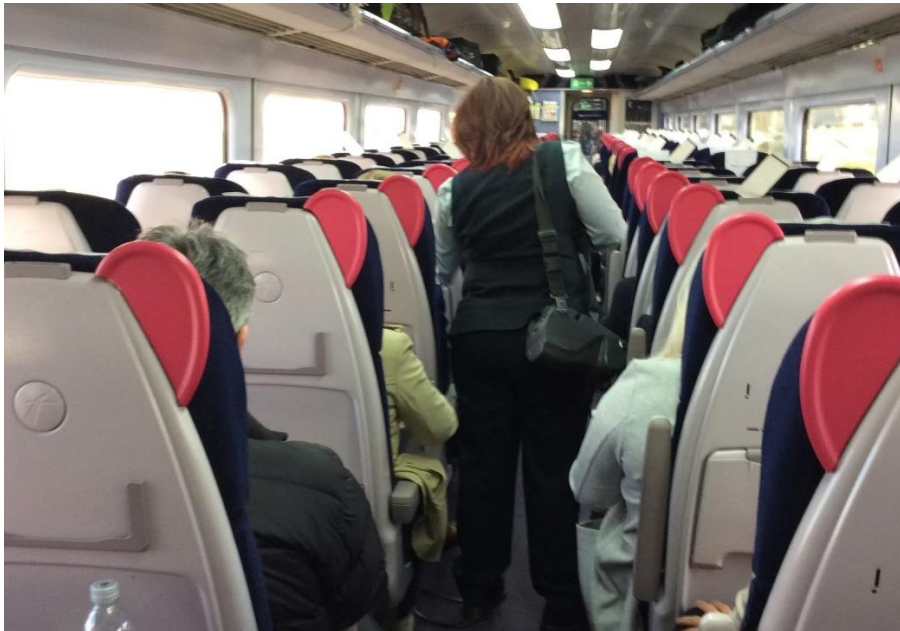
Figure 3 – TM checking tickets on a full coach

With the train moving, the crew member is happy to help and chat with passengers with diverse activities such as giving information, locating coaches and seats and placing luggage on the overhead racks. During the shadowing study, one TM was seen offering a first-class seat and fetching tea for a passenger in need of extra care. TM7 reported giving similar attention during the interview: “I had a passenger on a journey the other day who was just out of the hospital, and she was very pale, so I made sure she was looked after, she had water, something sweet, I kept attending her to make sure she was OK” . CH2 illustrates how the customer care activity can be rewarding in itself: “that’s nice when someone had some really shitty day and really everything is going against, and you can sort the problem, you can do something good, that’s nice as well, makes you feel nice” .