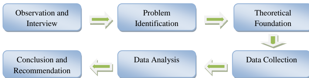
Grafik 3.1 Flowchart of Methodology

This research conducted for measuring the aggregate planning of CV Saswco Perdana for 2016 forecasted demand, using several strategies as comparison. There are six stages used in this research: Observation and Interview, Problem Identification, Theoretical Foundation, Data Collection, Data Analysis, and Conclusion and recommendation. First step is doing interview and discussion with operations manager to get the company overview and find the general problem that should be discussed in this research. Second step is identify the main problem of this research. Third step is do literature review in order to get theory and tools that will be useful in doing this research. Fourth step is gathering data, the types and techniques of data collection including primary data collected through interview with operations manager and general manager. And the secondary data gain from CV Saswco Perdana business documents and records, also from other research. The data needed to investigate what is the real current condition of the subject. Fifth step is collecting and then analyzing the data that already gathered to investigate what kind of solution that will be fit to solve the problem. Last step is to conclude the data analysis of the best solution that will solve the main problem and give recommendation.