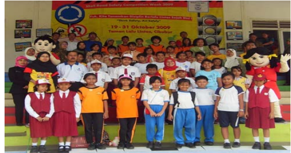
Fixtures 4

Road Safety Program conducted since June 2008. This is a program conducted by Shell Indonesia to create awareness and responsibility to the elementary school by giving to the children and realize the importance of traffic rules, and also form and train their skills to become habit that must be done when you're there on the road. The program is conducted through the activity of 33 schools in Jakarta about 3200 students get instruction in Jakarta and Depok.