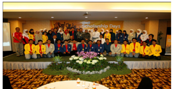
Fig 5

This scholarship is awarded to students who are less able and the lack of funding to continue the level of the course. This problem is still a lot happening in Indonesia, which until now not handled by the Government of Indonesia because so many students who cannot continue the level of the course. This is done by Shell Indonesia to contribute positively to the students so that it will produce a benefit in accordance with her wishes.