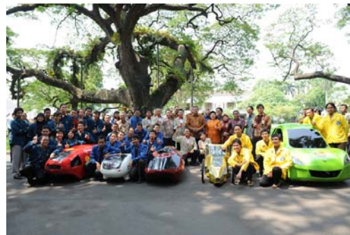
Fig 3. Source: bulletin CSR Shell Indonesia 2010

In addition to the award Shell Eco Marathon On Track Awards for prototype and urban concept vehicle, there are also awards Off Track Awards are given to safety, technical innovation, communication and marketing. Off track awards complement the Shell Eco Marathon Track award for this competition to see from all perspectives. Exia team of ITB win People's Choice Awards as the most popular team with more than 65,000 votes. Tim Dazzling and Yellow Makara of the UI are two of the five finalists for auto desk design award, this design category assess innovative research designs in terms of ergonomics, aesthetics, materials selection, and technical feasibility.