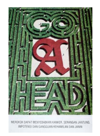
Figure 2. A Mild "Go Ahead" campaign print advertising

Sampoerna A Mild slogan is "bukan basa basi" or "not only lips service". In early 2010, A Mild has released "Go Ahead" campaign. This print as part of integrated marketing campaign is represented consumer perceived value of whole A Mild campaign.