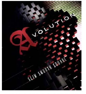
MEROKOK DAPAT MENYEBABKAN KANKER, SERANGAN JANTUNG, IMPOTENSI DAN GANGGUAN KEHAMILAN DAN JANIN

Sampoerna Avolution first launched in 2008. This product offers a unique shape or cigarette. Sampoerna made this product as slim cigarette, packed in square long box which arranged in 4x4 sticks. Standard pack 16 cigarette used to be arranged in 2x4 sticks.