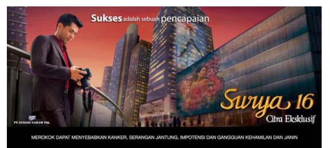
Figure 1. Surya 16 "The Photographer" Campaign print advertising

Surya 16's slogan is "citra ekslusif" or "exclusive image". In 2010, Surya 16 has made thematic campaign with tag line "sukses adalah sebuah pencapaian" or "success is an achievement".