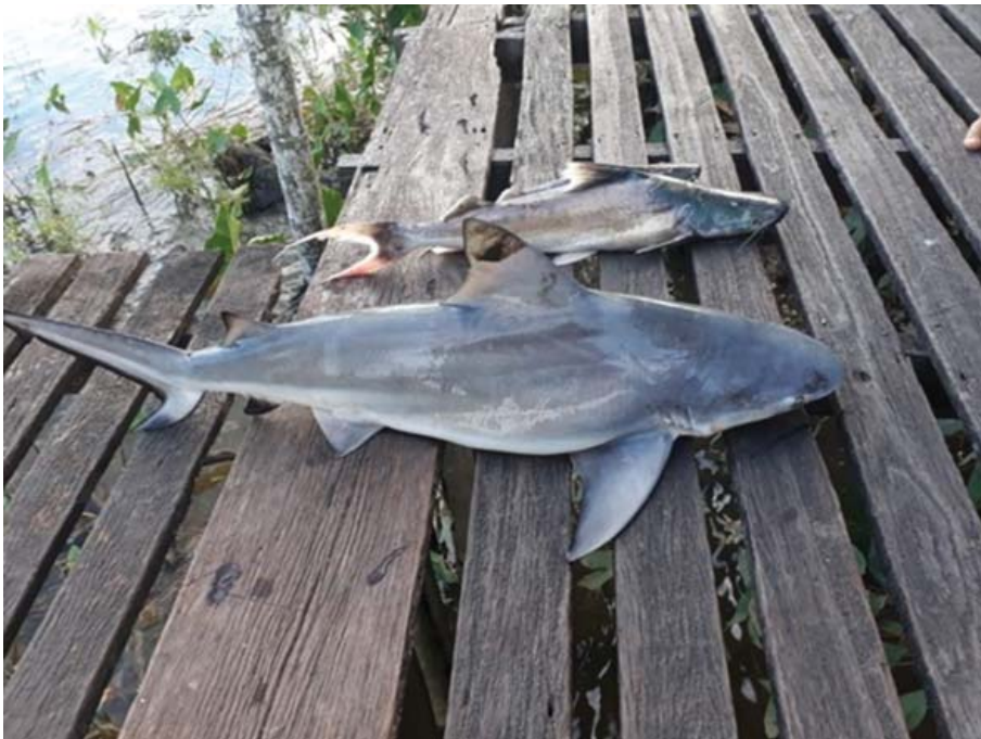
Figure 2. Young of the year female Carcharhinus leucas and Blachyplastyoma rousseauxii specimens captured by fishers in Cameté, Pará state, Brazil.