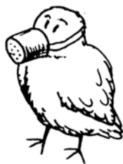
Little Bird – Hooray for Smoke-Free Air

Tobacco control coalitions have remained a constant in the ever evolving culture and environment of tobacco. Today there are tobacco control coalitions in every state and in many localities. Some address multiple components of tobacco control, while others are issue-specific or population-specific. Through coalition efforts, over 70% of Americans are protected from secondhand smoke due to the implementation of smoke-free provisions 13 ; half of the states have implemented a tobacco tax of $1.00 or higher 14 ; and the tobacco industry is continually exposed for marketing to underage youth, manipulative advertising, and using other deceptive tactics. These successes highlight just some of the many important elements that tobacco control coalitions have contributed toward changing social norms and enhancing national comprehensive tobacco control efforts. 15,16