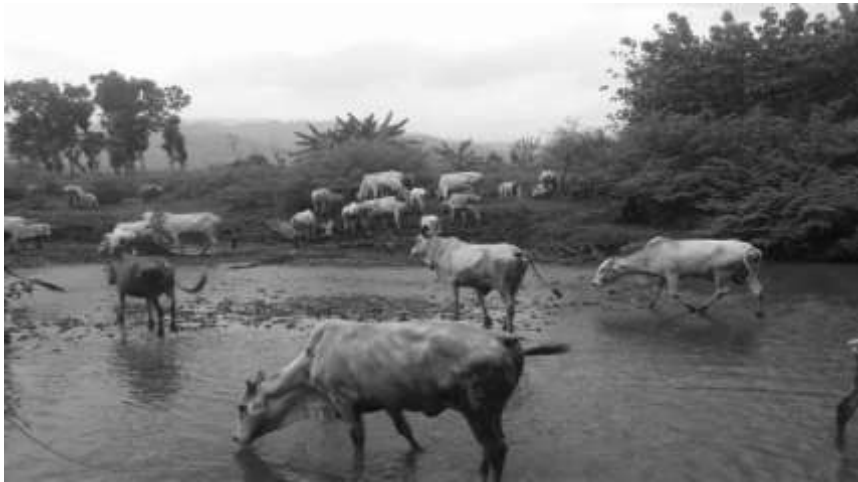
Figure 2. The appearance of the body condition of beef cattle.

The results of the research on service per conception (S/C) parameters indicate that, the S/C values in the LFS application group are significantly higher than those in the CLS and CLFS application groups. This is caused by the simultaneous effect of the appearance of the body condition of beef cattle in each group of farmers. Appearance body condition refers to the BCS beef triggered the intensity of the S/C, in other words if the value of the ideal BCS can express the value of the S/C is ideal anyway. As with the beef cattle whose body appearance is small or thin, the S/C value is higher.