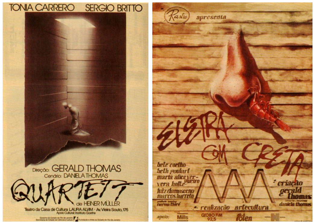
Figures 1a and 1b: Posters from Quartett (1985) and Electra com Creta (1986), both shows created by Gerald Thomas. The shift in the highlights, from stage and TV stars to sponsoring companies, illustrates broader changes in the modes of production of Brazilian theatre.

arrive in Brazil (mainly, but not only, through Thomas). Nevertheless, a general influence from theatrical semiology led Brazilian theatre scholars to see Thomas' deconstruction of linear senses and narratives as a liberation for the Brazilian stage from the shackles of representation and drama.