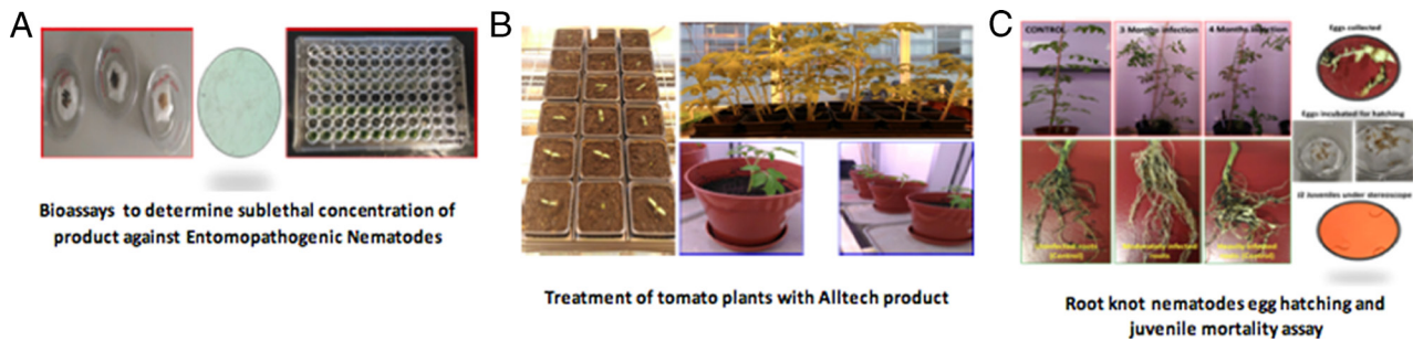
Figure 3: (A-C) Outline of Experiments.

none of these studies could be considered complete, in the context of integrated pest management, as they included no reports regarding product effects on biological control agents and specifically EPN. Considering a broad range of biological control agents could be difficult, however studying the effects of these products on closely related to PPN beneficial organisms is more feasible and relevant. Therefore, the present study is unique as it explores effects of the product on both harmful and beneficial nematodes.