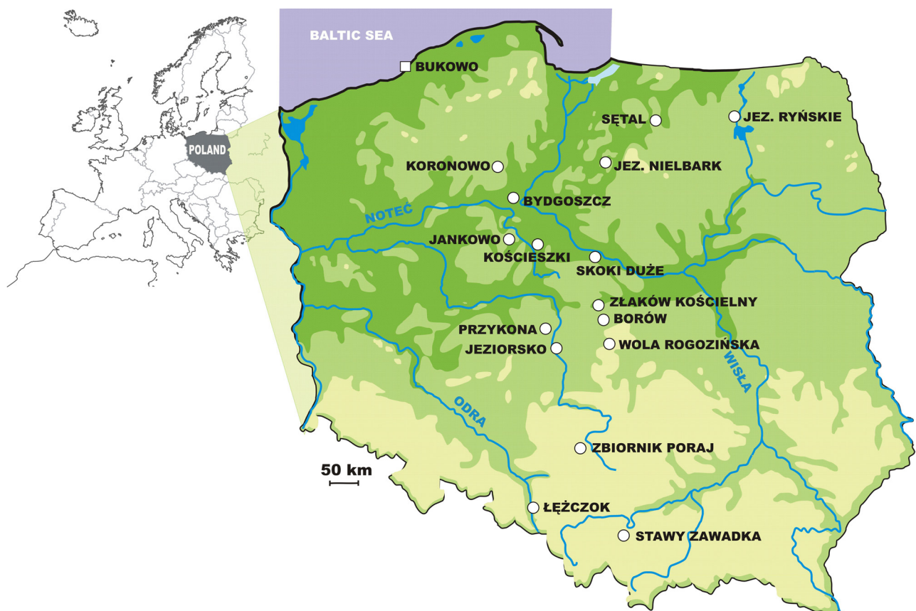
Fig. 1. Map of Poland illustrating the sampling places. White square: bird migration research station at Bukowo. White dots: localization of sampled black-headed gull colonies.

Capture and sampling of gull adult birds and nestlings in Poland. Altogether, 741 black-headed gulls ( Chroicocephalus ridibundus ) from 16 breeding colonies in Poland were captured in 2017 and 2018 (Fig. 1). The number of breeding pairs in individual colonies varied between 100 and 3,000. All individuals were captured between 25 April and 15 June, while brooding or feeding nestlings. Cloacal swabs were collected from 187 individuals in 2017 and 554 individuals in 2018.