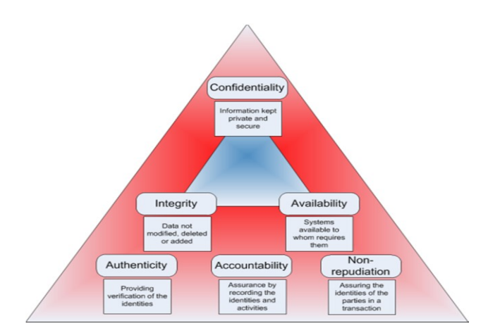
Figure 2. CIA Triad Security Services

used to provide source authentication are used to provide data integrity. Hardware implementations of these algorithms can limit their draw on system resources such as power and memory.