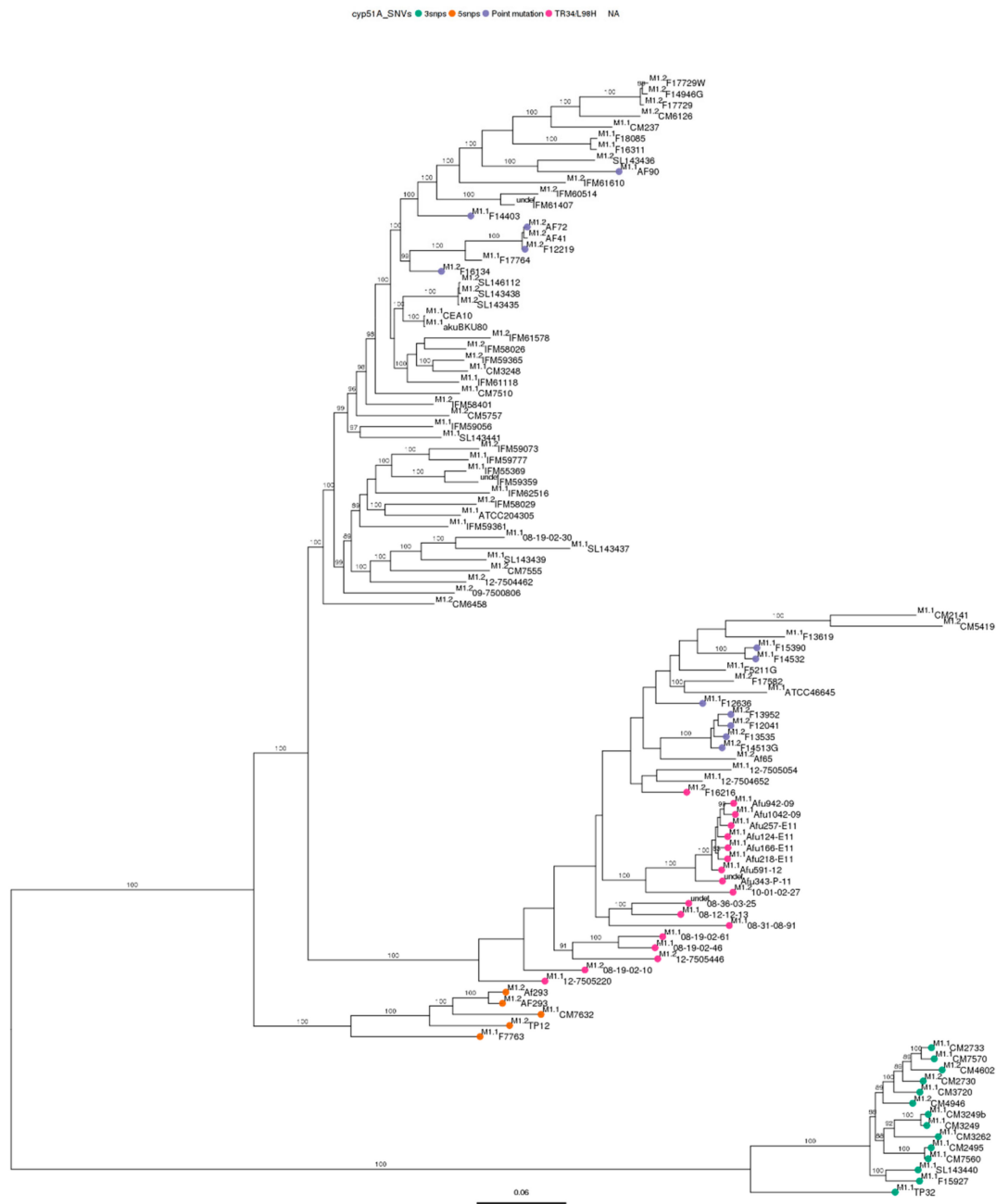
Figure 2. Whole genome phylogenetic analysis of 101 Aspergillus fumigatus genomes included in the study. Dendrogram was performed using A1163 as reference genome.