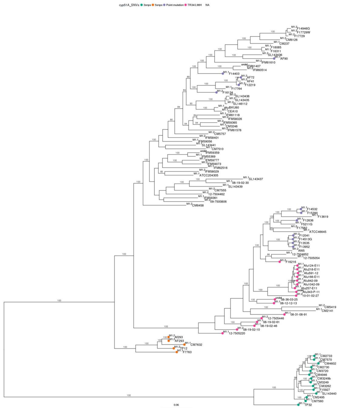
Figure 1. Whole genome phylogenetic analysis of 101 Aspergillus fumigatus genomes included in the study. Dendrogram was performed using Af293 as reference genome.

Therefore, based on phylogenetic analysis, the complete A. fumigatus population was divided into four well defined clusters (I, II, III, and IV). Two of them could be further subdivided into subclusters: cluster I split in 3 subclusters (I.1, I.2, I.3), and cluster II in 2 (II.1, II.2). Clusters III and IV remained undivided, because any subcluster was identified. Each subcluster was considered as an independent population group, and was used to compare itself against each reference genome (Table 3). The two reference genomes used were distributed in different clusters when compared against the other: A1163 in cluster I and Af293 in cluster III. The number of clusters and the tree topology was maintained regardless of the reference genome chosen.