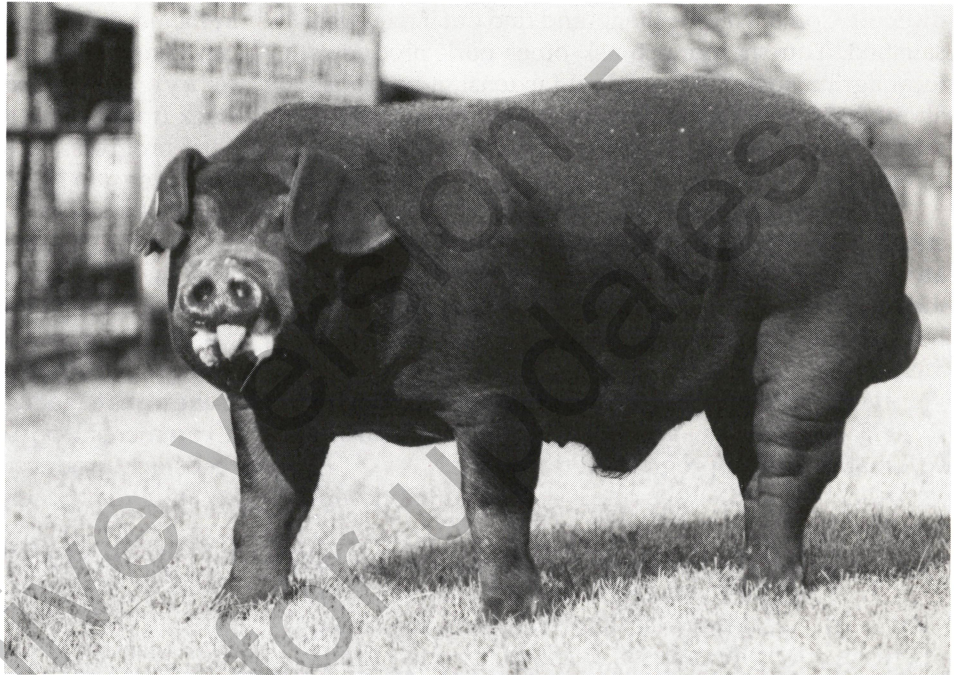
Top-gainer: Boar 11-3 was the top indexing boar at the 113th sale at the M.U. Swine Test Station. He indexed over 152 and his average daily gains ran 2.7 pounds per day. His average backfat thickness was 0.86 inches, and his pen-feed efficiency was 2.4 pounds of feed per pound of gain.

First, you should determine which breeds of boars are needed, how many per breed and the date they should be in place. A critical step for a successful breeding program is the correct operation of the crossbreeding program. If the crossbreeding program is conducted