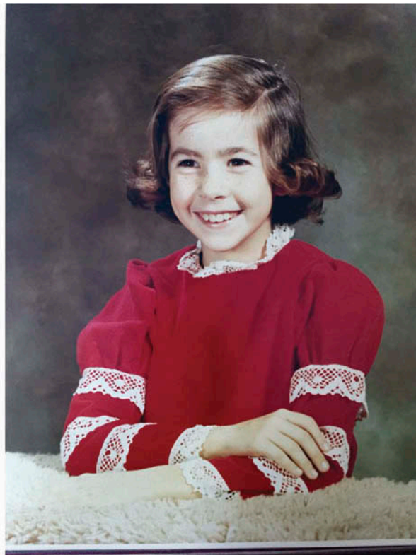
Figure 2. First Communion, 1971.

I recall my mom's thoughtful response to my communion. She wanted to have it on a day other than that of my classmates and during the fall on Thanksgiving weekend—giving thanks for our faith and accepting this sacrament. She carefully chose the color of my first communion dress, red, to symbolize the Holy Spirit (Archdiocese of Boston n.d.). Several years later she chose a green velvet dress for my younger sister to represent hope (Archdiocese of Boston n.d.). She understood the symbolism well, since she sewed vestments for our parish priests on a regular basis. At the same time, in the early 1970s, my mom had begun to advocate for women's rights, but mostly at our dinner table. Her campaign for reform was targeted mostly at the Catholic Church—for logical reasons, it served as the center of our lives—but she sought to reform from within. I question: how do women make