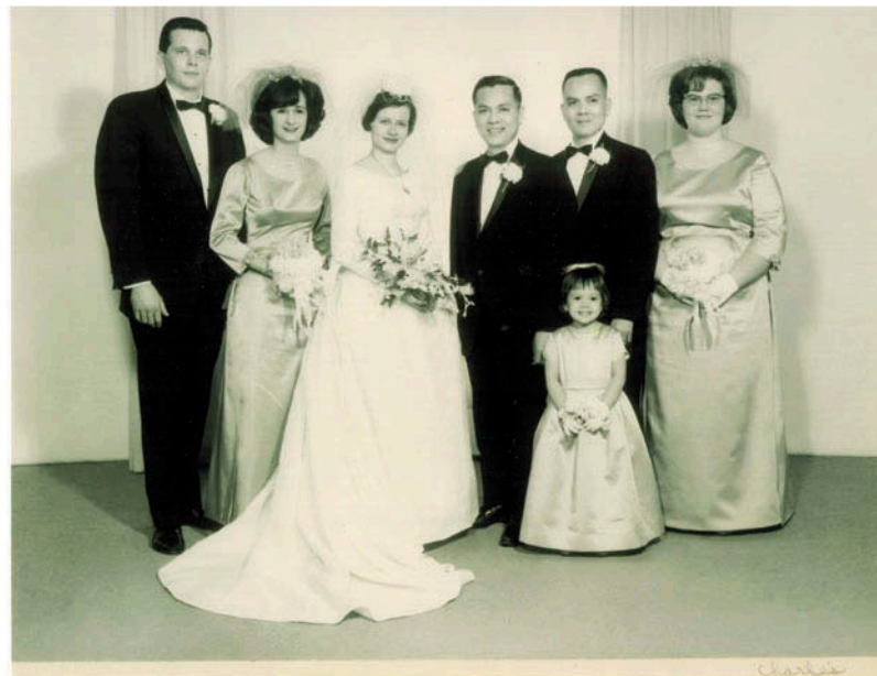
Figure 3. Bi-racial Family Circa, 1964.