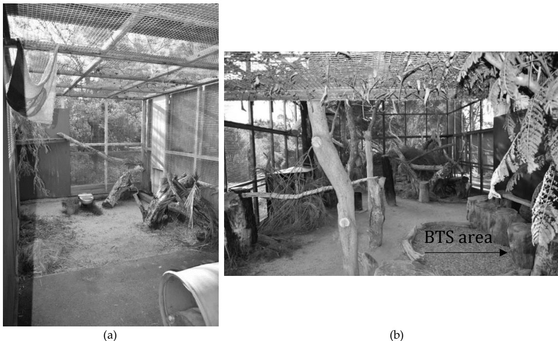
Figure 1. (a) Serval pen. The cats could move between the three adjacent pens via hatches that could be closed from the outside by the keeper when necessary. Pens were identical in size and had similar environmental features to the pen shown in the picture. (b) Serval yard with a designated area for behind-the-scenes (BTS) encounters on the right.

The servals were housed off public display and could only be seen by the visiting public during presentations or behind-the-scenes (BTS) encounters. The servals were housed solitarily and alternated between an open yard (Figure 1b) and three adjacent pens (Figure 1a). The keepers swapped the cats' housing on a daily basis. The open yard had a total area of approximately 75 m 2 and a ground cover of sand and mulch. The yard was interspersed with logs, elevated platforms, and climbing structures, had a covered nest with a straw bed, a drinking trough, and a designated area for visitor interaction (Figure 1b). The pens had a total combined area of approximately 36 m 2 and a ground cover of synthetic turf mats and sand. The pens also had elevated shelves, burlap hammocks, cat tunnels, drinking troughs, and heated beds for overnight rest (Figure 1a).