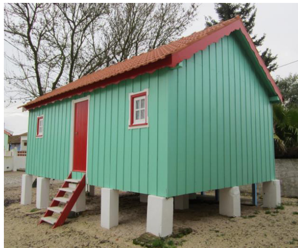
Fig. 2 Village of Escaroupim (Portugal) 2016: stilt-house in the best status of conservation and the closest to the architectural matrix.

On one hand, this ICT platform results are an exhaustive survey of these wooden stilt-houses and will be a guideline for spatial planning policies, strategies and instruments in order to protect and enhance this vernacular architectural legacy. On the other hand, this software can be used in other similar wooden buildings, in order to check their status of conservation, and therefore to define the best rehabilitation actions. These rehabilitation actions can be done whether regarding the contents of national and regional spatial policies (considering an overview of all buildings and villages), or local strategies (defined for each village and its buildings) due to the needs and expectations of local communities.