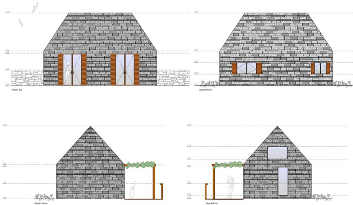
Figure 7. Rural touristic project proposal (some architectural details of the buildings) Fajã de Baixo – Madeira island, Portugal.

With this project the small rural settlement of Fajã de Baixo will be save from a massive touristic occupation, keeping its natural, cultural and architectural identities. At the same time, there is the opportunity for locals to have a job and to keep their traditional way of living and gastronomy.