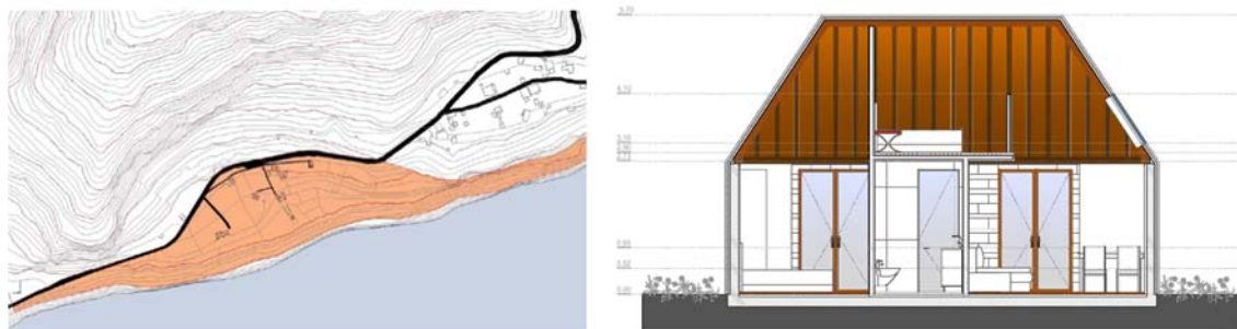
Figure 6. Rural touristic project proposal (water front / some architectonic details) Fajã de Baixo – Madeira island, Portugal.

Thus, the project includes 6 touristic houses, in a plot of about 1000 m 2 , using traditional construction materials such as the local stone and wooden structures, combining the traditional and the modern. This low-density solution aims to be able to attract only a few number of users, keeping the previous standards of a low-density place, in order to be an answer not only for visitors but also regarding the traditions and features of local people (Figure 6 and Figure 7).