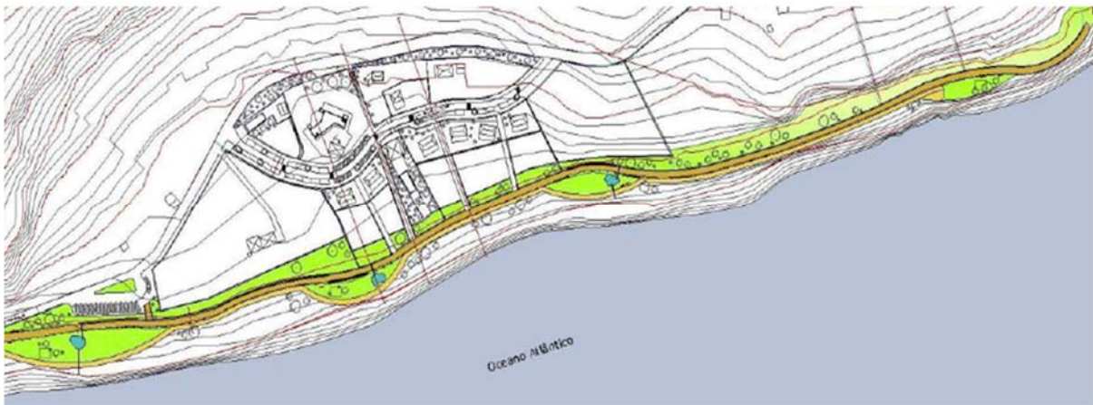
Figure 9. Rural touristic project proposal (promenade near to the Atlantic sea – as the urban design solution main landmark) Fajã de Baixo , Madeira island - Portugal