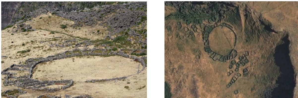
Figure 1. Sheep Shearing Corals, rural area of Paul da Serra - Madeira island in Portugal.

One of the outcomes of the previously referred process was the abandonment of rural territories in seek of better opportunities in the newly industrialized urban centers. The migration of young people to the cities has caused the over-densification and expansion of urban boundaries, intensifying the contrast between urban and rural realms. The rural became abandoned, aged, neglected and disregarded, marking the beginning of the decline of rurality as a way of living. In fragile territories, such as small islands like Madeira in the Atlantic sea, which is part of Portugal, the decline of rurality lead to the abandonment of practices like sheep shearing, this used to be a yearly event reuniting people from all over the island, today the degraded stone corals located in Paul da Serra are a vanishing memory of these practices and a part of the rural way of life.