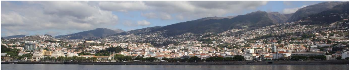
Figure 2. Urban sprawl to rural areas – Funchal , the main city in Madeira island (Portugal).

The first urban development plan for Madeira is from 1997, Master Plan of Funchal (the main city of Madeira island). Until then, there was a weak control of building and urbanization processes. The planning process of rural areas requires solutions to advance their economic and social realms. Tourism can be a pivotal way of achieving these goals, ensuring the sustainability, preservation, identity and sociocultural features of rural areas, maintaining the harmony between locals and tourists.