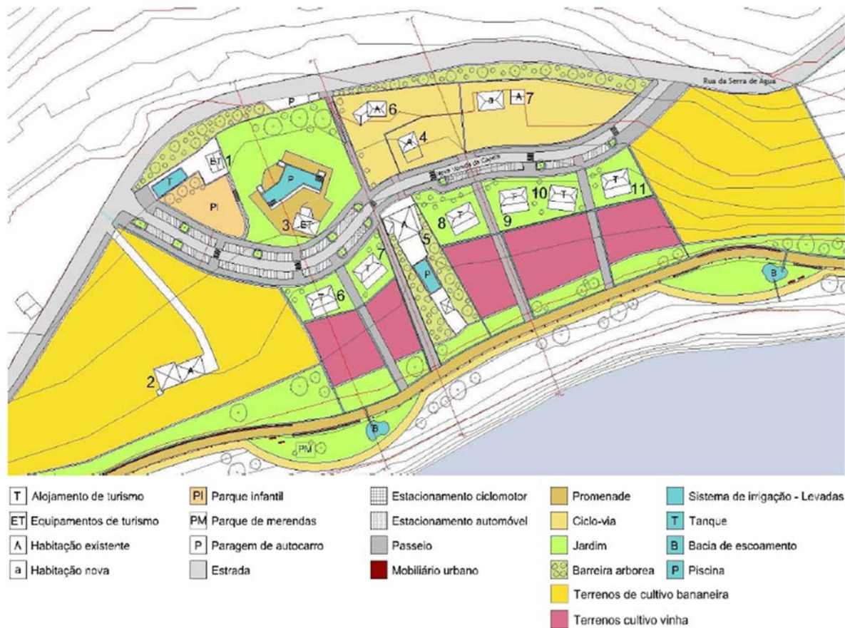
Figure 10. Rural touristic project proposal (final solution) – Fajã de Baixo , Madeira island - Portugal.