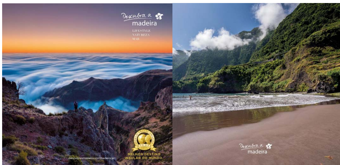
Figure 3. Tourism campaigns of the Madeira islands destination, [1].

In Portugal, the tourism profits (in 2015) have reached 11.400 million euros. The main destination is the Algarve (35,1% of the overnight stays), followed by Lisbon (24,9%) and Madeira (13,6%). An awareness and sensitivity with ecology and sustainable practices are coming up at the tourism practices. Because of tensions in Mediterranean Middle East countries, and national campaigns of propaganda, tourists are rethinking their destinations and choosing Portugal (Figure 3).