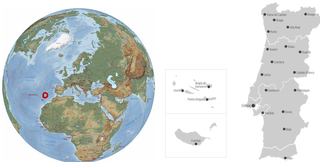
Figure 5. Geographic localization of Madeira island – Portugal, [7, 8]