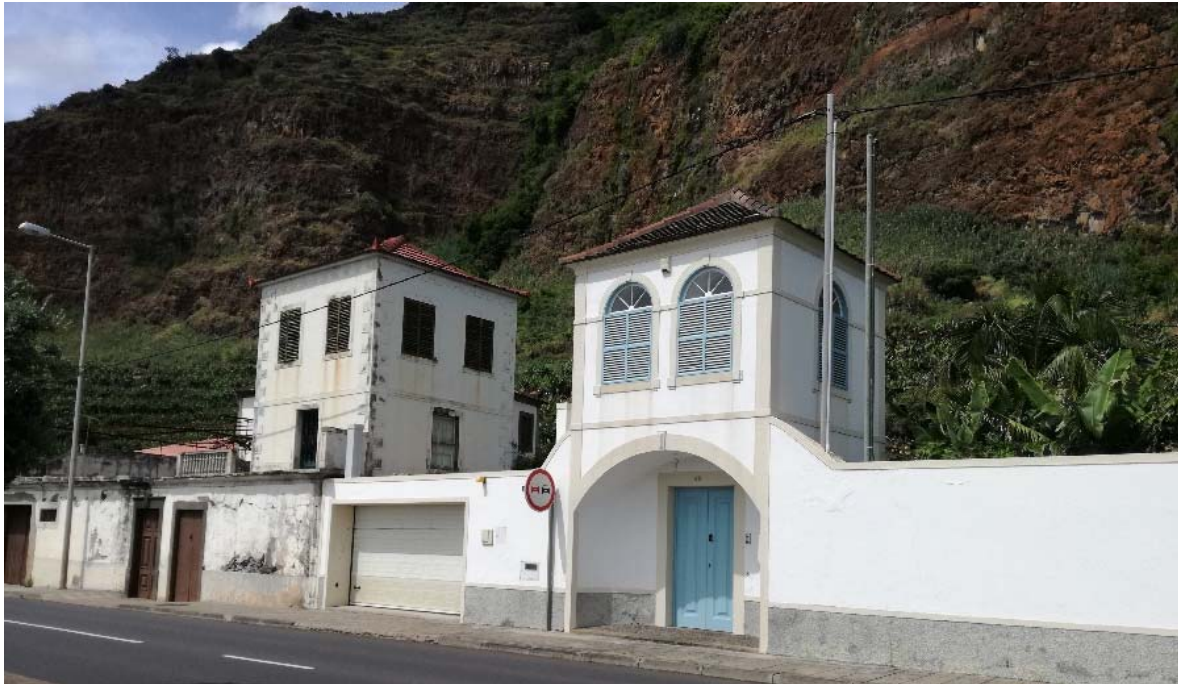
Figure 4. Rehabilitated house for tourism side by side with degraded house, Madalena do Mar in Madeira island – Portugal.