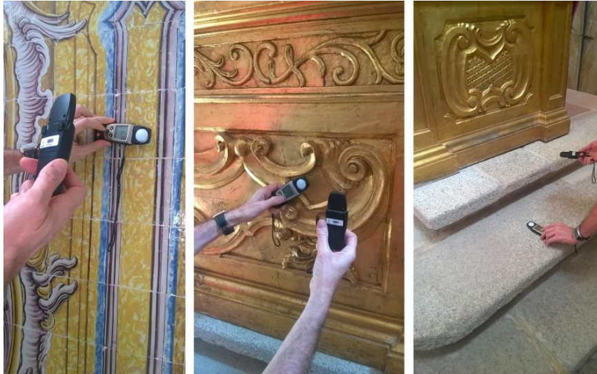
Figure 3. Monastery of S. Bento de Cástris: measure the levels of illuminance in different materials

confirmed “in situ”, as well the registry of covering materials with different colours and shapes (figure 3). As effective daylight strategies have become an essential goal for any sustainable building, critical design questions of the choirs are seeking through produced trustable simulations tools [4]. The survey of all the materials present in the space was indispensable to be able to use in the 3D model as closest to reality as possible [4].