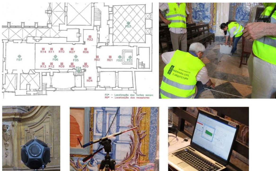
Figure 6. Monastery of S. Bento de Cástris: measuring reverberation time

According to Martins and Carlos [1], it was necessary to provide the ORFEUS Project team with information on the actual acoustics of the Church of the Monastery of S. Bento de Cástris and to establish knowledge regarding the architecture and the duality of its choirs. Consequently, results obtained must be compared with the current recommendation for this type of space. In Portugal, an acoustic study was carried out at the Cistercian monastic Church of St. Bento de Cástris [11], [20]. In this study, high Reverberation Times (RT) were confirmed, including subsequent changes. This feature suggests a lack of intelligibility of speech. However, considering that the church was built in a period when the religious ceremony was essentially sung, a higher RT in this space is expectable (in later Cistercian's monasteries, wood carvings, decorations and even panelled ceilings were used). As such, greater intelligibility of speech can be intuited. These cases are in accordance with the evolution of the liturgy, for which intelligibility acquires greater importance and justifies less reverberation [11], [20], [21]. The existence of reverberation, on the other hand, also suits the use of the organ in Church, which use is justified for being an instrument of choice on a significant period of history. The organ accompanied the plainchant which, due to its characteristics, was more intelligible in reverberant spaces when compared to other religious chants [20].