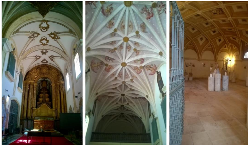
Figure 2. Monastery of S. Bento de Cástris: the monastic church and its choirs

The feminine Portuguese Cistercian Monasteries have always the choir separated by a grid. The nuns' access was possible usually by the inside of the monastery without having to cross the church. The nuns' choir is located at the end of the nave, opposite the apse, in a higher or lower position [4], [7]. But there are two exceptions: a) the double choir of S. Bernardo de Portalegre at the end of the nave, one above the other, this is, one high choir above the low choir, and b) the double choir of São Bento de Cástris, one lateral low choir, directly connected to the apse, and a high choir at the end of the nave [4], [7], [9].