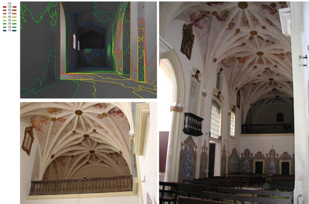
Figure 4. Monastery of S. Bento de Cástris: church and high choir

light falls on the internal northern wall while in the afternoon, the west end of the church recedes into darkness [4].