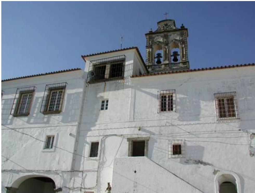
Figure 1. Monastery of S. Bento de Cástris: Church wall

The Monastery of São Bento de Cástris (13 th - 19 th centuries) has been a National Monument since 1922 and it is located in the region of Alentejo, on the hill of São Bento, about two kilometres away from Évora [4], [9]. Currently, the monastic building presents architectural features that fit within a period between late 15 th century and early 16 th century, with traces of the final Gothic as well as mudéjar (which is a stylistic mixture between Cristian and Islamic Art in some Portuguese regions that were under Islamic influence before, and during, the Christian Reconquest). These artistic and architectonic influences were always reconciled with Cistercian requirements [4].