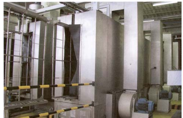
Fig. 4. Logistic units washing system.

The current washing high efficiency of handling and transportation units for bodies and mechanical components has been improved with new equipment (cheaper) fed by a high thermal efficiency circuit (low heat losses in ducts).