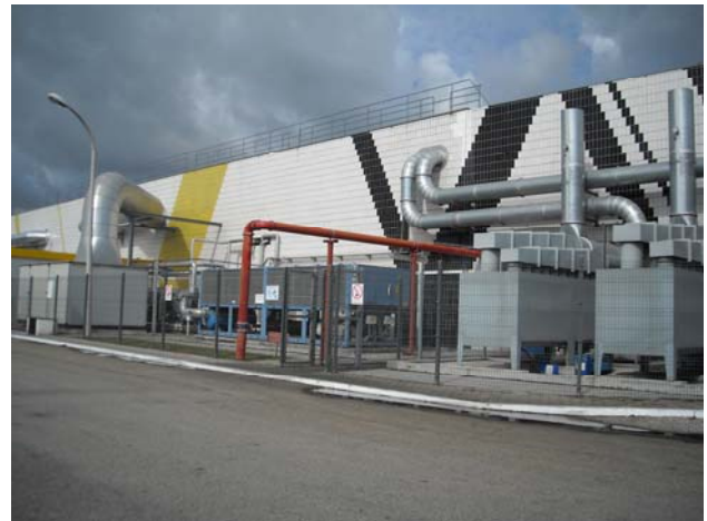
Fig. 6. Air handling unit.

transferred to the workspace by high capacity heat exchangers (aerotherms).