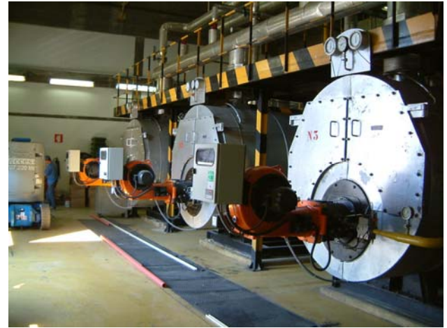
Fig. 3. Heating boiler (3).

The production efficiency and hot water supply to various plant equipment, including centralized washing of handling and transportation units of components and mechanical parts between factories, and the thermal comfort in production areas has been improved by installing a new distribution system with high thermal efficiency (closed circuit water flow with high thermal losses in duct walls) between the fluid central shown in Fig. 3 and equipment.