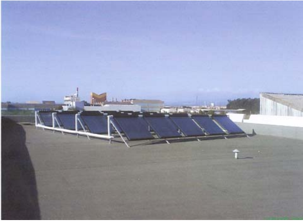
Fig. 7. Installation of 20 solar thermal panels in the north building.

In this case, the gas consumption data throughout the year allows direct assessment of the facility economic interest, whose design lifetime of 20 years ensures profitability, environmental improvement and an interesting period of investment return as shown in Table 2.