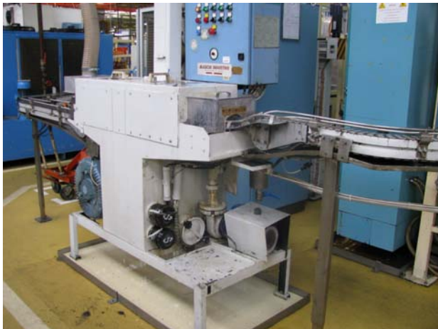
Fig. 5. Components washing module system.

The observation of thermal losses in large washing machines used in the factory led to the development of a new concept: instead of large systems that require constant technical support and full load to be used efficiently, a new solution based in small washing modules integrated in the supply chain enabling washing a piece individually, with minimum consumption of energy, water and detergent. These modules are heated by electric heaters and controlled by temperature sensors that automatically turn on and off the heating of water flow and components drying with high efficiency.