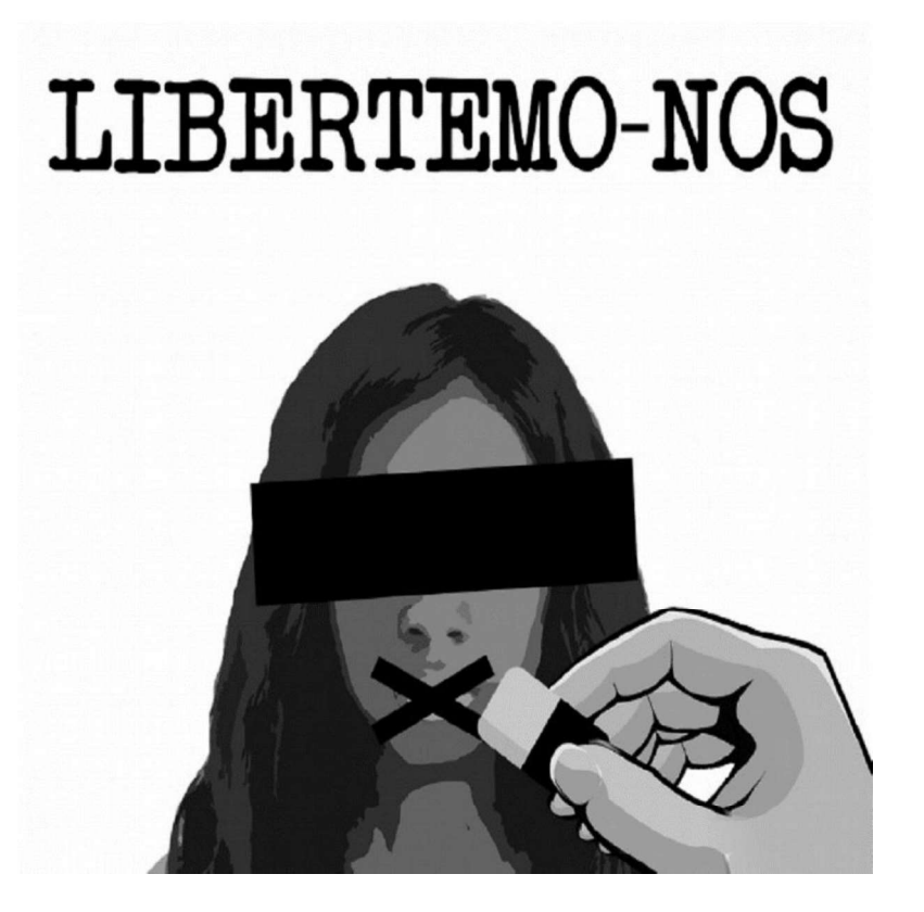
Figure 2 Melina Bassoli, Libertemo-nos, 2 018.

Thus, this zine demonstrates how it can go beyond the usual formal structures to add meaning.