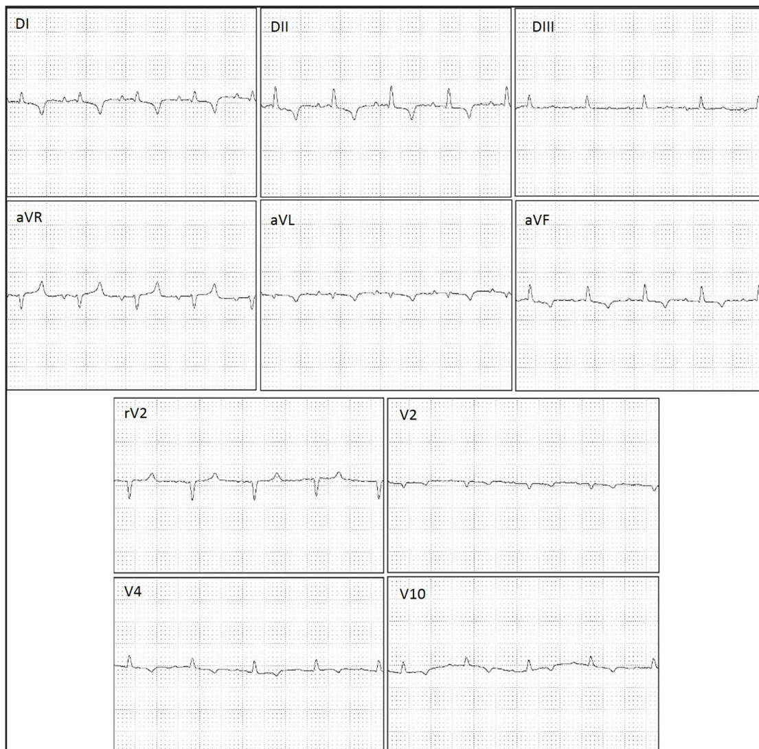
Figure 2. Normal digital electrocardiographic tracing recorded in 25 mm/s and from healthy peccaries ( Tayassu tajacu ) chemically contained with ketamine and xylazine. Note the QRS complex was positive in the DI, DII, DIII, aVF, V4 and V10 derivations and negative in the aVR, aVL, V1 and V2 derivations.

The cardiac electrical axis (EEC) showed variations between the individuals. In 10 animals the cardiac electrical axis varied between 7° and 115° (Figure 3A), while in 4 animals, between -7° and -150° (Figure 3B).