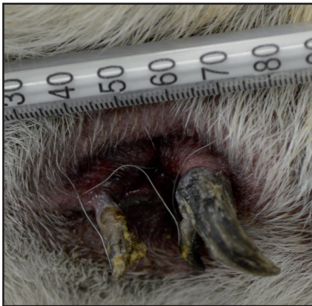
Figure 1. Clinical photographs of the perianal area with a 100 UI syringe used as a size parameter. A 6-month-old, male, Pug in right lateral recumbency. Note there are two tumors resemble horns (cutaneous horns) arising from mucocutaneous junction of external anal sphincter. Both were higher than wide in base.

Finally, there was no tumors recurrence suggesting that the primary underlying lesions have been healed