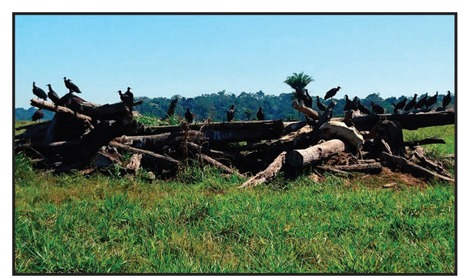
Figure 5. Carcasses clustered to the wood for incineration.

We sent the bones found in the reticulum, as well as ruminal contents, reticulum, rumen, and intestine fragments, under refrigeration to the Laboratory of General Bacteriology of the Biological Institute, São Paulo, SP, to detect the botulinum toxins by the mouse bioassay method. Furthermore, we collected the encephalon and brainstem, which was maintained under refrigeration and formaldehyde, to perform the differential diagnosis of rabies and bovine spongiform encephalopathy through direct immunofluorescence and immunohistochemistry, respectively. All analyses presented negative results.