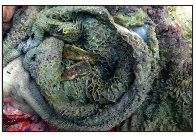
Figure 4. Bone fragments found in the reticulum with clinical signs of botulinum intoxication.

The animal died the next day, 36 h after the beginning of the clinical signs. We found no specific anatomopathological changes during the necropsy, only related to the time of decubitus and agony, apart from the presence of long bones fragments found in the reticulum (Figure 4).