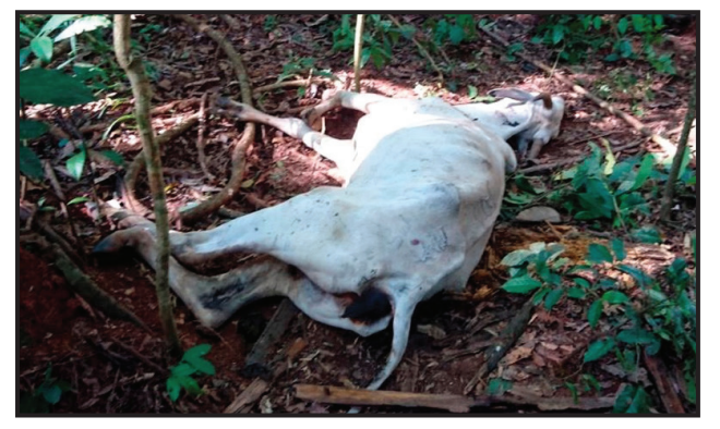
Figure 3. Bovine in lateral decubitus and respiratory distress.

After the anamnesis and evaluating the facilities, we examined the last affected bovine, which presented clinical signs similar to those of the others, approximately 24 h earlier. This animal was found in lateral decubitus in a forest area, away from the herd (Figure 3).