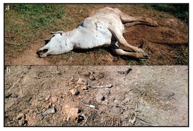
Figure 2. Bovine carcass decomposing in the pasture. a- Animal in decomposition; b- Cadaver remained for months or even years in the pastures until their complete decomposition.

C.M. Nobre, T.I.B. Silva, G.C. Costa, et. al. 2019. Botulism in Cattle Associated with Osteophagy in the State of Acre, Brazil. Acta Scientiae Veterinariae. 47(Suppl 1): 430.