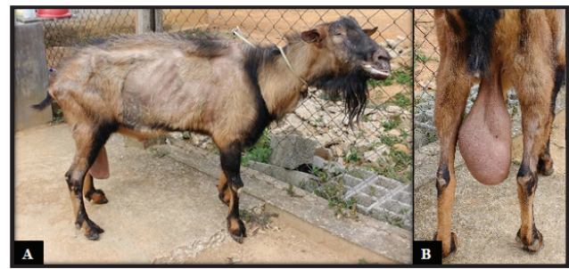
Figure 1. A- Male Alpine goat (12-year-old) presenting chronic cachexia. B- Asymmetric scrotum with enlarged left and contralateral right testicles.

Due to the poor prognosis and regard for animal welfare, the goat was euthanized according to the