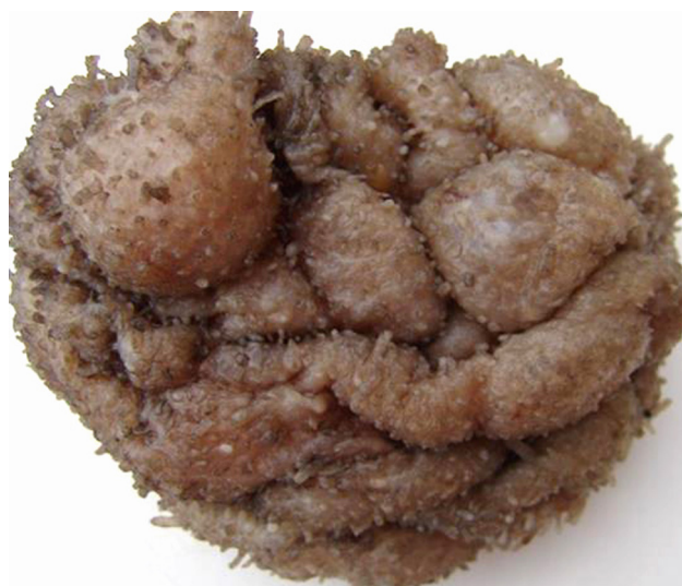
Figure 1. Rumen fragment with wall thickening, cystic areas and a reduction size and number of rumen papillae.

Gross inspection of the steer revealed decrease in the amount of muscular and adipose tissue. An extensive lesion covering approximately 40% of the ruminal surface was noted. Grossly, it consisted of