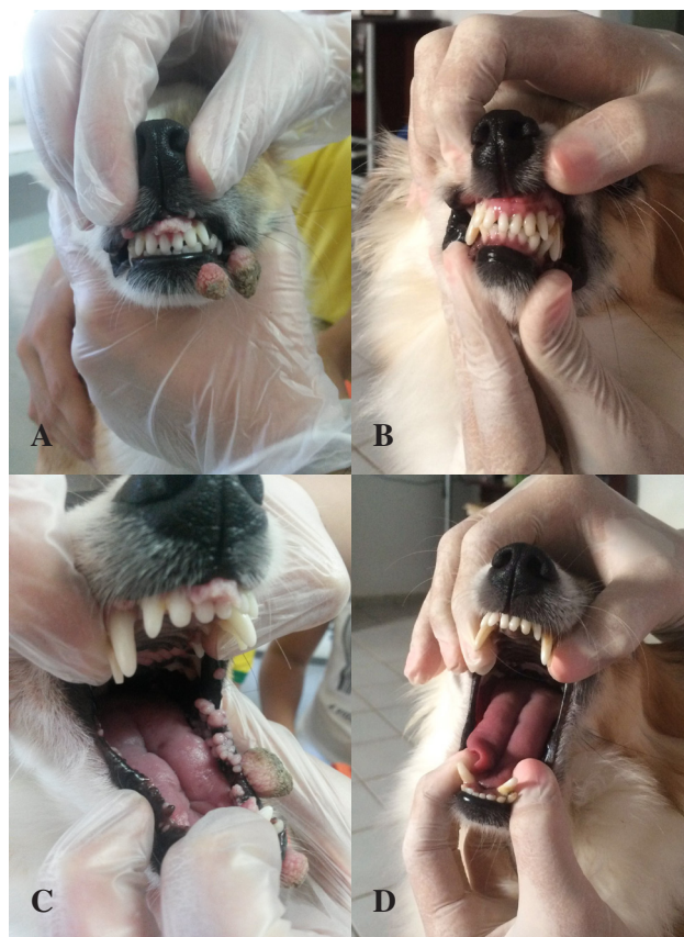
Figure 1. A & C- Macroscopic appearance of a dog with oral papillomatosis before AHT treatment; B & D- Absence of papillomas after 24 days of AHT treatment.

The owner after being given an explanation on the therapeutic technique to be adopted authorized the treatment. The autohemotherapy consisted of aseptically collecting a 5 mL whole blood sample without anticoagulant from the jugular vein, which following trichotomy and asepsis was immediately injected