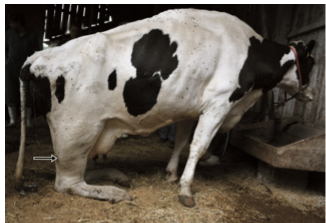
Figure 1. Holstein cow with complete bilateral gastrocnemius rupture. In an attempt to keep normal stance the animal presents the tarsal joints flexed, and metatarsal bones disposed in parallel to the ground. Moderate enlargement of muscles located proximally to the tarsal joints (arrow). Tail paralysis and urinary incontinence were observed.

At necropsy, both gastrocnemius muscle were severely enlarged, showing mild crepitation and moderate edema. At the cut surface, muscular groups showed dark-red to blackish color, with areas of emphysema, and draining moderate amount of serosanguineous fluid. In some areas there was a moderate amount of fibrin distributed on the musculature (Figure 2). Popliteal lymph nodes were severally enlarged. A complete rupture was observed at both insertions of gastrocnemius muscle in the calcaneus bone. Additionally, the sacral vertebrae gross evaluation revealed a 2 cm fracture located in the body of the S2 (Figure 3), associated with focally extensive hemorrhage in the leptomeninges.