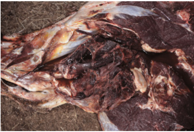
Figure 2. Right hindlimb. The muscles located proximally to the tarsal joint present dark-red to blackish color (extensive hemorrhage and muscular necrosis), serous fluid (edema), and moderate amount of fibrin deposition.