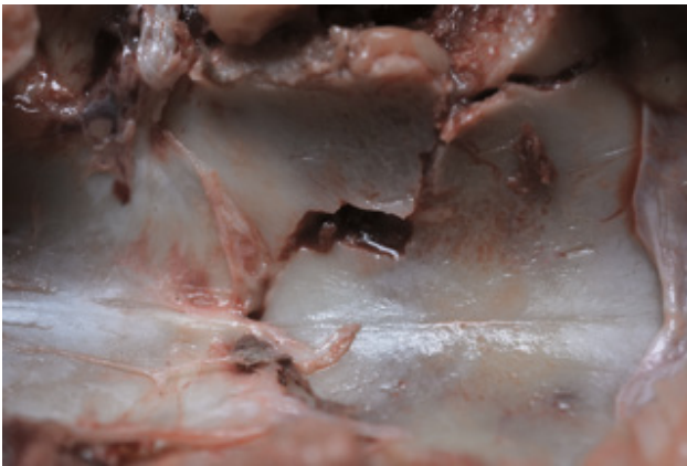
Figure 3. Vertebral column. A fracture measuring approximately 2 cm is observed in the second sacral vertebra (S2).