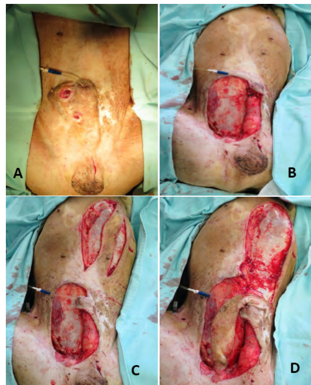
Figure 1. Surgical intervention for resection of an inguinal tumor. (A)- A 15 cm hemangiosarcoma in the right inguinal region affecting the skin on the body of the penis. (B)- Skin defect after resection. (C)- Mammary gland flap prepared up to the second mammary papilla. (D)- A 160° flap rotation directed cranially to the prepuce and then caudally to the inguinal region.

After 100 days, the animal exhibited severe cachexia, selective appetite, hyporexia, apathy, prostration, and limited mobility. Neurological examination revealed hyperreflexic patellar, gastrocnemius, sciatic, and cranial tibial reflexes, lack of superficial nociception, decreased response to deep pain perception, as well as meaningful proprioceptive ataxia on both pelvic limbs. Sensation of intense pain was present on the lumbar region. The trunk muscle reflex was absent at the level of L6. Lumbar spine radiography revealed osteolytic and sclerotic lesions of vertebral bodies between L3-L4 and L5-L6. These lesions were suggestive of discospondylitis or axial bone metastasis. In view of the poor prognosis, decreased quality of life, and poor response to palliative treatment, euthanasia was performed. Necropsy exam was not allowed by the owner.