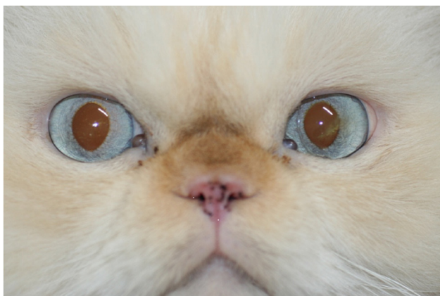
Figure 1. Cat on presentation. Cysts on the medial canthus at the eyelid margin in both eyes.

A 5-year-old male Himalayan cat was referred to the Ophthalmology Section in the Veterinary Clinics Hospital of the Federal University of Rio Grande do Sul (UFRGS), Porto Alegre, RS, Brazil with a history of pigmented masses in both eyes that had been progressively enlarging over a 1-year period. The cat was well-nourished and presented good clinical condition. The cat was visually unimpaired with pupillary normal light reflexes in its both eyes (OU). Ophthalmic examination revealed two cysts on the medial canthus at the eyelid margin in both eyes (Figure 1). In the left eye was observed blepharospasm and lacrimation. In that eye,