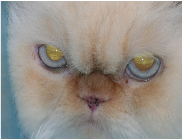
Figure 3. Macroscopic view of the cat three years after surgical procedure.