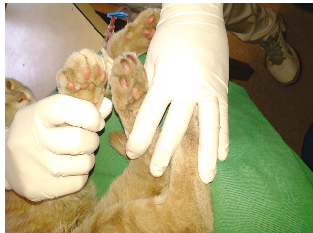
Figure 1. Note the different color between fore limbs and hind limbs. The extremities of the fore limb are pink and the pelvic member are with cyanotic extremities (Source: Personal Archive).

A male, adult, mixed-breed domestic cat was admitted to the Veterinary Hospital of the Veterinary School presenting difficulty in walking with the hind limbs and severe pain, according to reports of the owner. Physical examination revealed adequate nutritional status, mucous with normal color, normal heart rate (180 bpm), tachypnea (60 mpm), normothermia, eight percent of dehydration, severe pain in the gastrocnemius muscle region, cyanotic and cold extremities of the hind limbs (Figure 1) and absence of bilateral peripheral pulse checked with vascular Doppler. With these clinical signs it was suspected of a case of aortic thromboembolism.