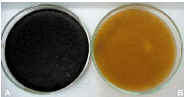
Figure 1. Sporothrix schenckii isolates after seven days of incubation. (A) Dark-pigmented colonies cultured in PDA-ethanol. (B) Orange-pigmented colonies cultured in PDA-ethanol-tricyclazole.

All pigmented isolates of Sporothrix schenckii cultured in PDA-Ethanol displayed pigmented colonies varying from dark gray to black, whereas the isolates cultured in PDA-Ethanol-Tricyclazole turned orange in color (Figure 1).