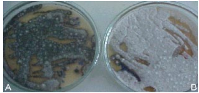
Figure 2. Sporothrix schenckii isolates after exposure to 300 ergs/mm 2 UV radiation and seven days of incubation, protected from visible light. (A) Pigmented isolates. (B) Mutant albino isolates.

Isolates cultured in YEPD, not exposed to UV light, formed pigmented colonies with colorations that gradually evolved from light dark to dark gray. Wild type isolates of Sporothrix schenckii exposed to UV radiation and protected from visible light formed mutant albino colonies, i.e., colonies of white coloration, characterized by well-defined edges, compact formation, and slightly velvety in their centers and adherents to the agar (Figure 2); one isolate specimen formed colonies with irregular edges, compacted, membranous and highly adherent to the agar.