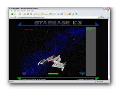
Figure 2: Snapshot from Strile Fighter game in Ajax3D.

Strike Fighter - was developed by Larry Rosenthal of Cube Productions. It has been running a science fiction virtual world/online community called StarbaseC3 for nearly that long. In 2001 were developed the first version of a 3D web game called "Strikefighter," in VRML programming. Last year Strkefighter was updated for X3D and showed new model based on architecture with Ajax3D, the game connected with web server (running PHP and MySQL) that implements a scoreboard. When the game is over, it checks the current score against a database of high scores residing on the server. Strikefighter is similar to the Flash-based mini-games that have proliferated on the web over the last several years.