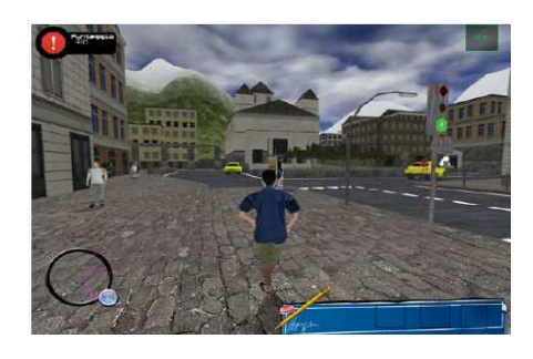
Figure 3: Snapshot from Road Rider.

Road Rider - is an interactive first person 3D game, where the player controls a virtual character whose task consists in reaching the site of a rock concert. During her/his trip, the user walks around a city (that is a 3D reconstruction of a portion of the Genoa city center - figure 3). The game plot consists of a number of "missions". Missions involve finding a car, getting money to buy a ticket for the concert, driving the car to visit friends who live in different cities to another, and finally reaching the destination site. Every mission features an increasing level of difficulty. In order to enhance the player's engagement, the game plot is dynamic. All the important game situations are tied to road safety (road-signs, vehicles, roads, cross-roads, pedestrians, etc.). And this is true also for the score rules. Score is a fundamental element of the game, since it provides the main motivation for a user to improve her/his performance. So, the criteria according to which points are assigned are very important because they define what layers' operations, actions and behaviours are positive and what are not relevant or even negative. In Road Rider, the system penalizes hazardous behaviors and rewards safe road-behaviors.