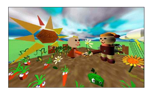
Figure 4: Snapshot from Narrative, Immersive, Constructionist/Collaborative Environments.

NICE is an outgrowth of two previously designed systems, CALVIN and the Graphical Storywriter.