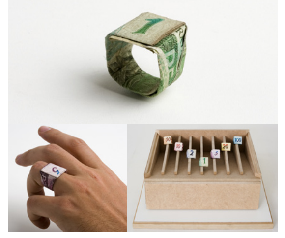
Figure 8, 9 and 10. Real Transeconomy (2007). The object as money bills.

For example, the acid tone of the two works mentioned in the previous question already had its genesis in Fuzilamento [Shooting, 2002] when you stood naked and you read in front of an audience that threw cement on a list of social revolutions that had happened. That acid tone is still more evident and precise due to the fact that its reading reminded us of the procedure and the tone used by the concrete poets. A single work fused several – political, social, ideological and artistic – references to fusion and subjected them to irony. The serious tone of a speech of a poet or a statesman who recites or addressed his people is lost, booed, destroyed. There is no hierarchy or verticality. Power is deposed.