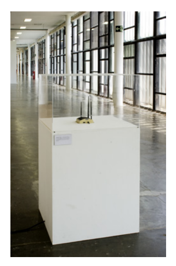
Figure 5. Friendly Fire (2006). Mobile phone jammer. Variables. View of the Work at the 27<sup>th</sup> São Paulo Biennial: How to Live Together. Biennial Pavilion, São Paulo. 2006.