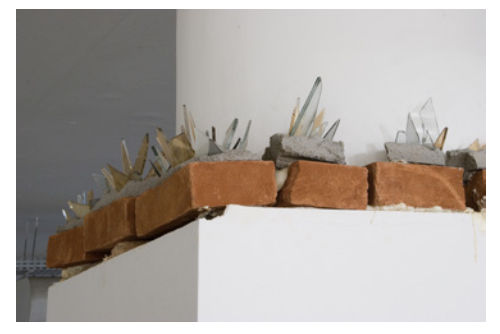
Figure 12. Inside walls (2005). Bricks and glass shards. Variables. View of the Work at the 27<sup>th</sup> São Paulo Biennial: How to Live Together. Biennial Pavilion, São Paulo. 2006.

works, of established realism, of a real problem. I have no need to solve anything, only to show the problem in another light. It's a question that I've been asked through my works. Nowadays, there is less and less of this desire– perhaps as there was in the 2000s with the collectives – to assure a more militant artistic practice, of aiming at establishing radical changes and speculate about revolt, even if it's static, through the work of art. I've found my space: facing political facts as they are rather than thinking that a romantic aspect of art can change something in an instant and agile way.