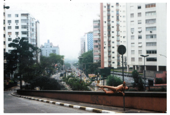
Figure 1. I-Horizon 2 (2000) Photography. 70 x 100 cm.

and, in the case of crime, several works approach the subjects, but I emphasize Eu-Horizonte 4 (I-Horizon 4, 2000). I would like you to comment on these points.