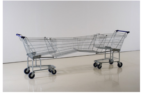
Figure 2. Right and Left (2007) Sculpture with four modified supermarket trolleys. Variables.

could also be political in the context in which Eu-Horizonte appears, when I was able to combine the use of experimentalism of performance and illegality for the first time, because being naked in the city is a crime against morals and proper conduct, in order to break standardization, which would be the verticality of the city, and create this horizon with my own body. A horizon as a metaphor for hope, that horizon we never reach with our own bodies. Back to your question, the relationship between art and crime has always been an important motive for me because I'm interested in using the urban level or the public level in an anarchic way.