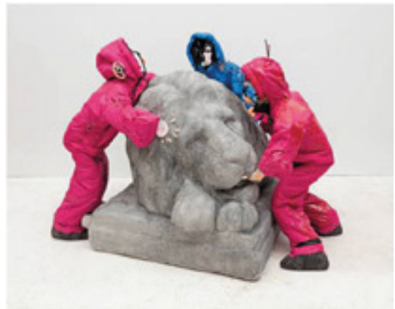
Figure 5. Ajay Kurian, Here to Help , 2016, wearable sleeping bags, aluminum wire, duct tape, epoxy clay, 3-D-printed cereal, plastic chain, fake leaves, sand, foam, concrete, Rockite, paint, hardware, incense sticks, polyurethane, 40 × 66 × 52".

I'm really scared of that. I've seen it. I saw it in the movements I've been involved in, the AIDS activist movement and other left movements. I abandoned sectarian politics to join AIDS activism, because AIDS was never a single-issue political movement—the epidemic touched on every issue, and AIDS activism was nonsectarian, unlike the established Left of the late '70s and early '80s, which was hampered by terrible infighting. And now I feel that again, in the kind of politics that are arising now, and it's frightening to me.