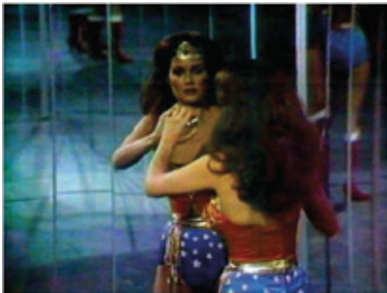
Figure 2. Dara Birnbaum, Technology/Transformation: Wonder Woman , 1978–79, video, color, sound, 5 minutes 50 minutes.

That is why I think that you cannot simply own your own history of being oppressed, or of suffering. Of course that experience is specific. Of course it creates its own communal language and experience. It creates its own ability to construct a history. But it has to be seen in terms of relationality, of a history of dynamic interactions.