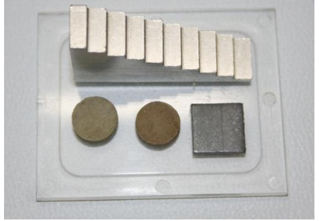
Figure 1: Specimens, aluminum step wedge and lead plate.

The sets formed by specimens of tested materials, aluminum stepwedge and lead plate were irradiated over Insight E/F occlusal films (Kodak Eastman Company, Rochester, New York, NY, USA) on a support of styrofoam for 0.4s (Figure 1).